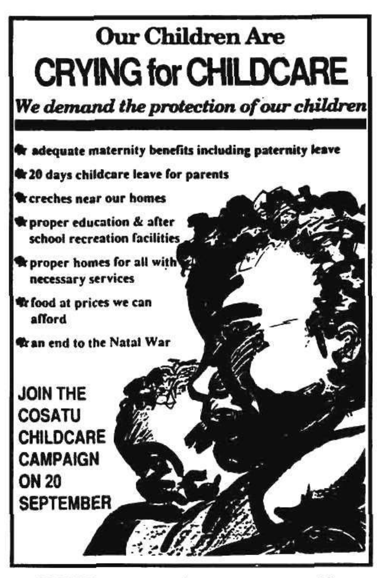
COSATU's recent campaign supports parental rights.

Various factors facilitate the creation of these liberal parental rights in Sweden. Sweden is run by a government in which workers are well represented. Negotiations take place between the labour movement and the state and many agreements are enacted as law. This means agreements extend to all workers, as opposed to South Africa, where agreements hold only for