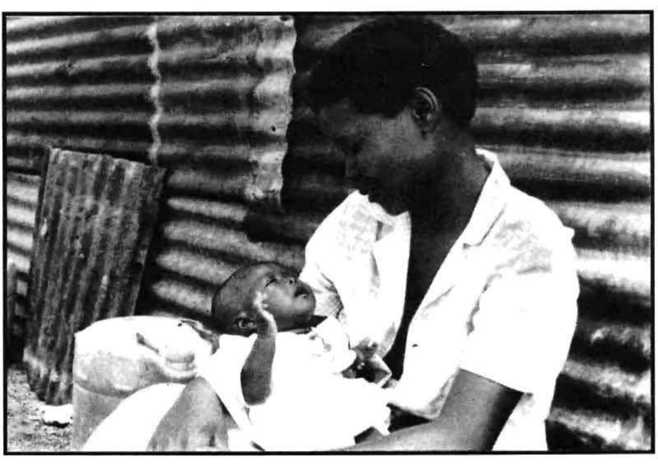
Parents have the right to have a job and the time to take adequate care of thier children.