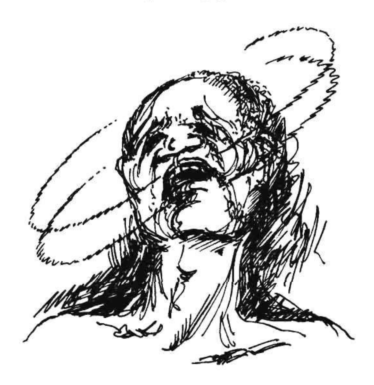
Many detainees choose to go for counselling to work through their feelings after the stress of detention

Appointments to be seen in these services are made through the detainee aid centres. (See contact addresses on previous page)