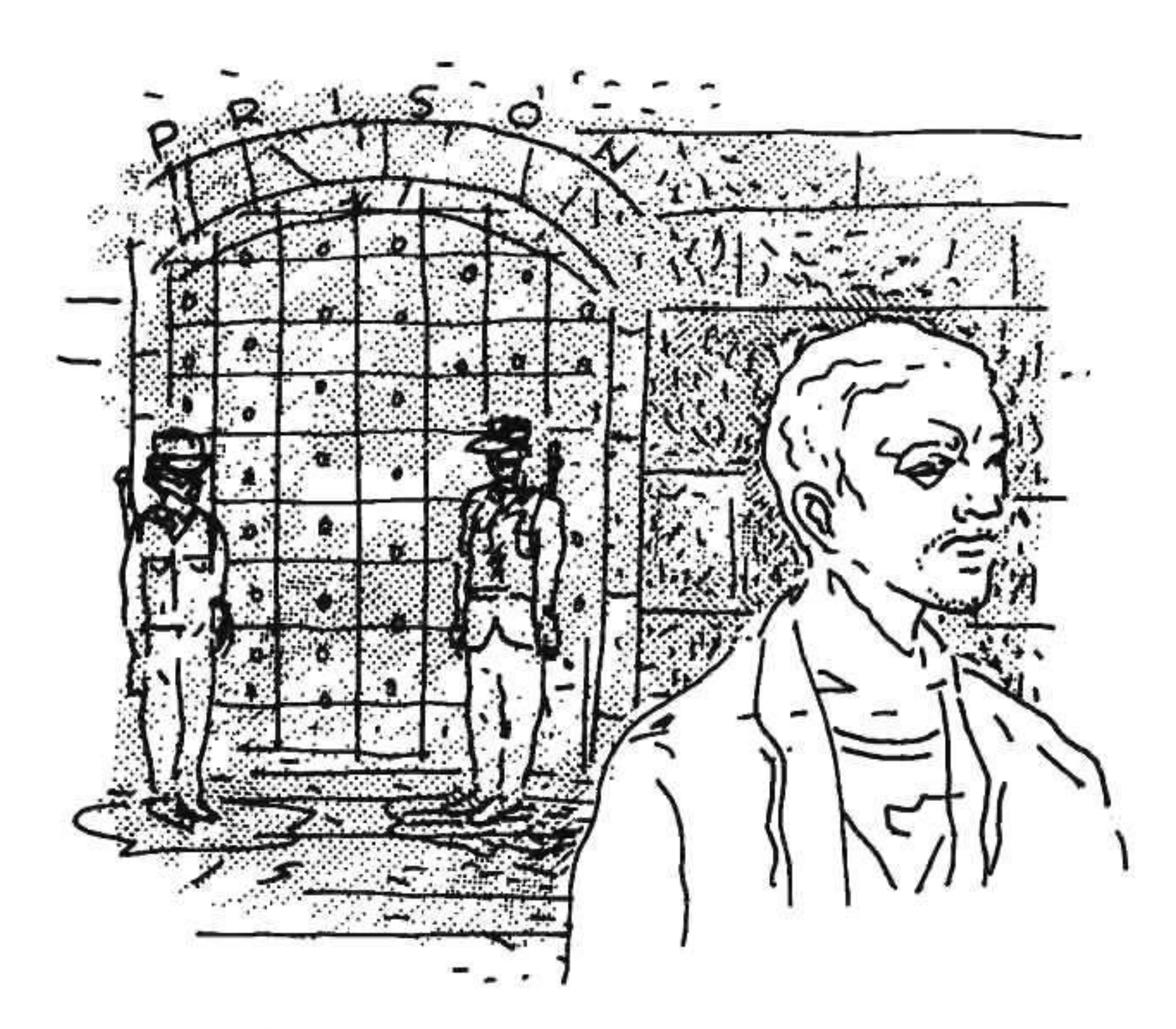
Upon release from detention, ex-detainees can attend special health services, run by progressive health workers

The health services differ according to the number of health workers and the way they are run. However, in most health services, one sees both a doctor and a counsellor.