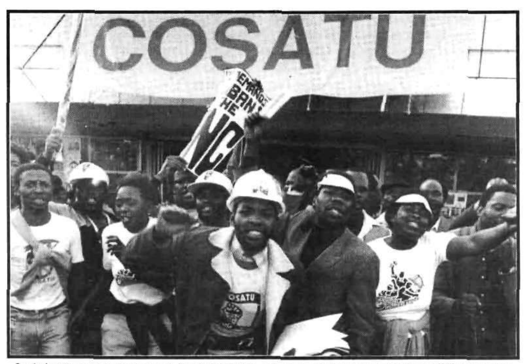
In their response to the demand for medical aids, unions can help lay the basis for a NHS, or can see their members becoming the support-base for health privatisation.

As a rule, health and safety structures in unions range from frail to non-existent. Health and safety as whole is a low priority in most unions.