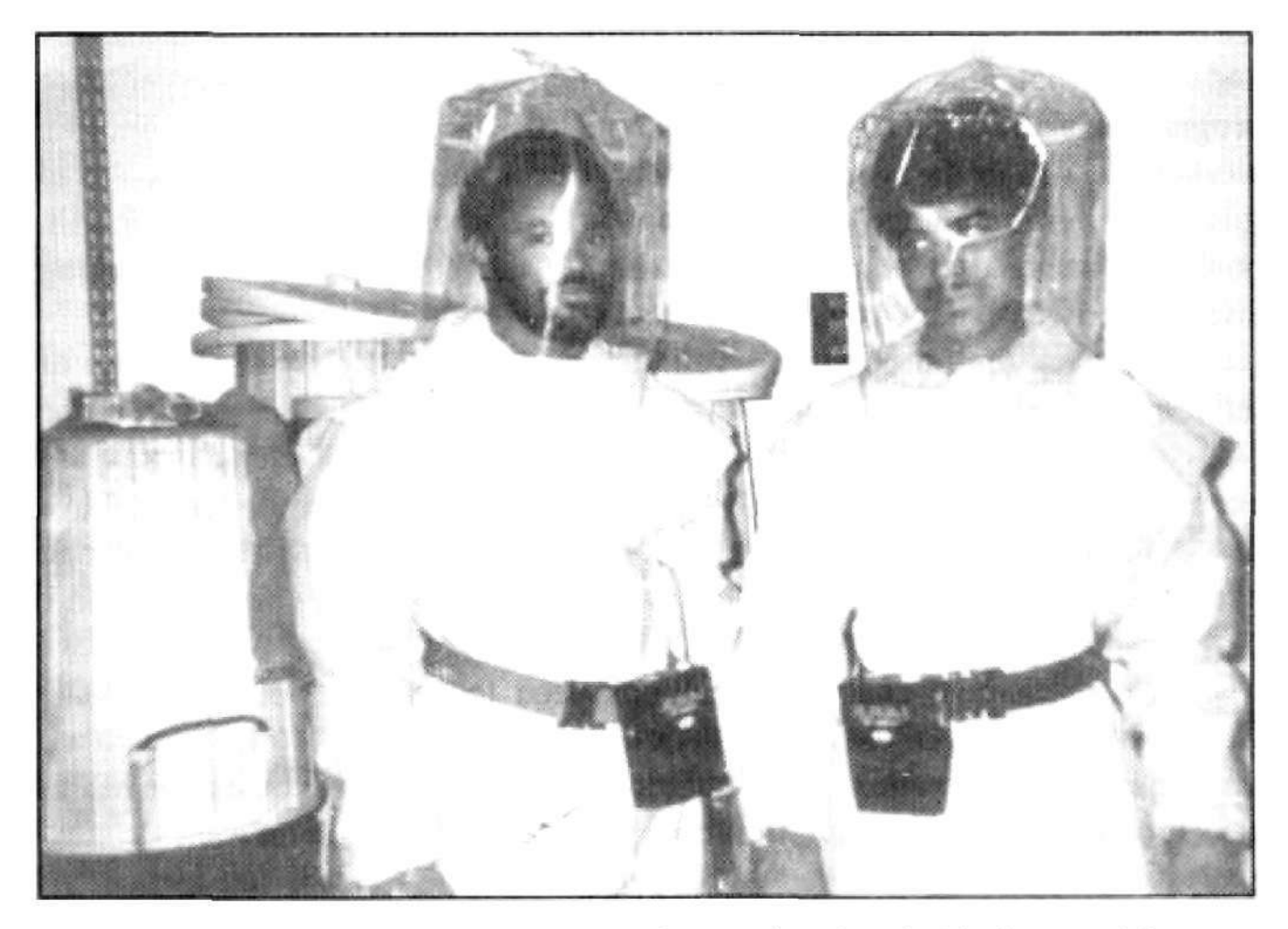
Personal protective equipment makes work safer - but is it enough?

In order to cut costs, employers rely on personal protective equipment rather than a safer work environment. At the plant under study, a significant reduction in dust levels was achieved through the use of airhoods, but they were not entirely effective in preventing exposure. The limitations of personal protective equipment were only made worse by the use of inappropriate or poorly maintained equipment and the lack of emphasis on training the workers. This is clearly an unsatisfactory approach. More attention needs to be paid to the work