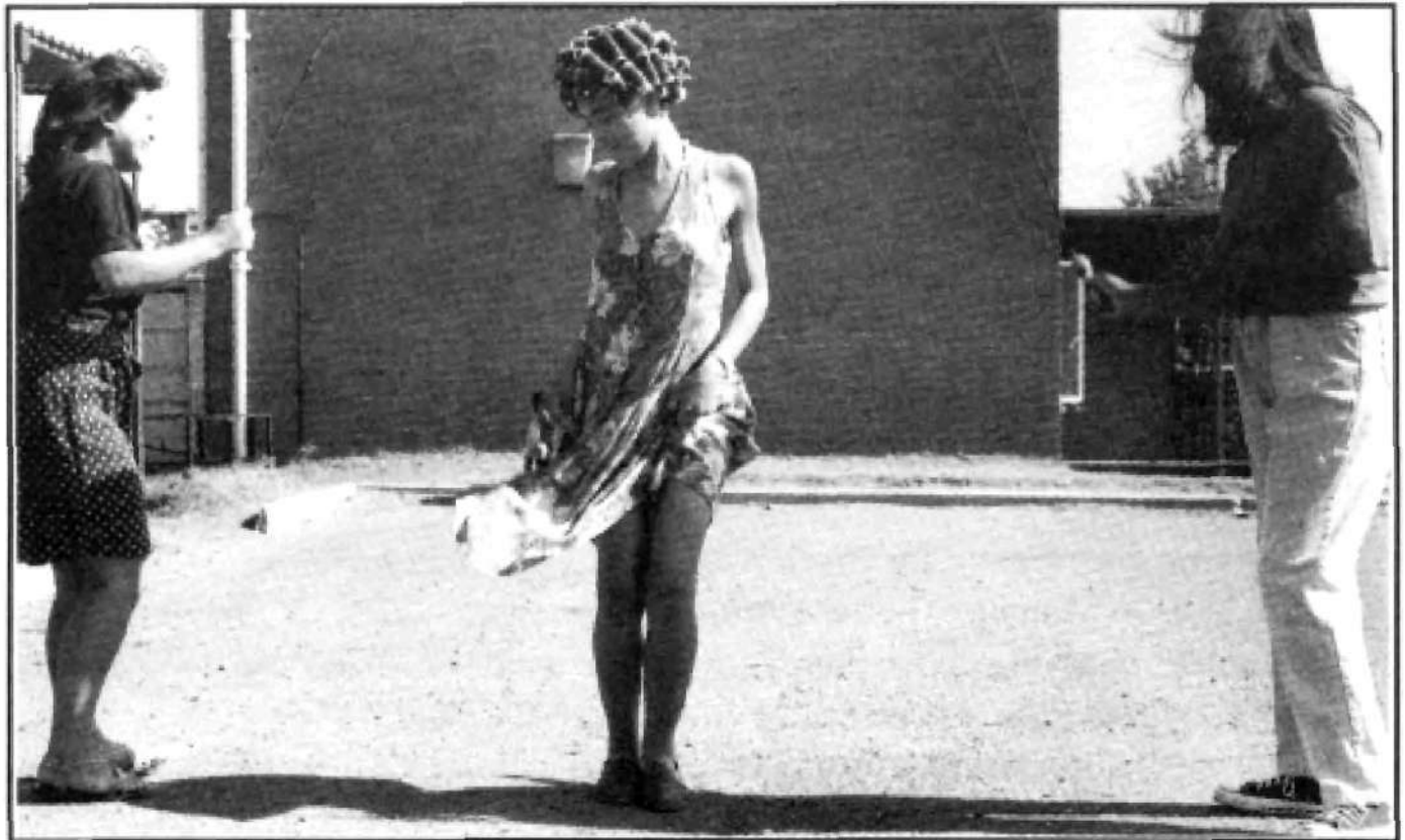
Women need to be alerted about the problems relating to violent relationships.

quired. There is a need to raise awareness and educate both youth and old people that violence can not be condoned, as well as to inform women about their legal rights and to enable them to understand that violence is a social epidemic. Work also needs to begin at pre-school and primary school levels to alert children about the problems relating to violent relationships.