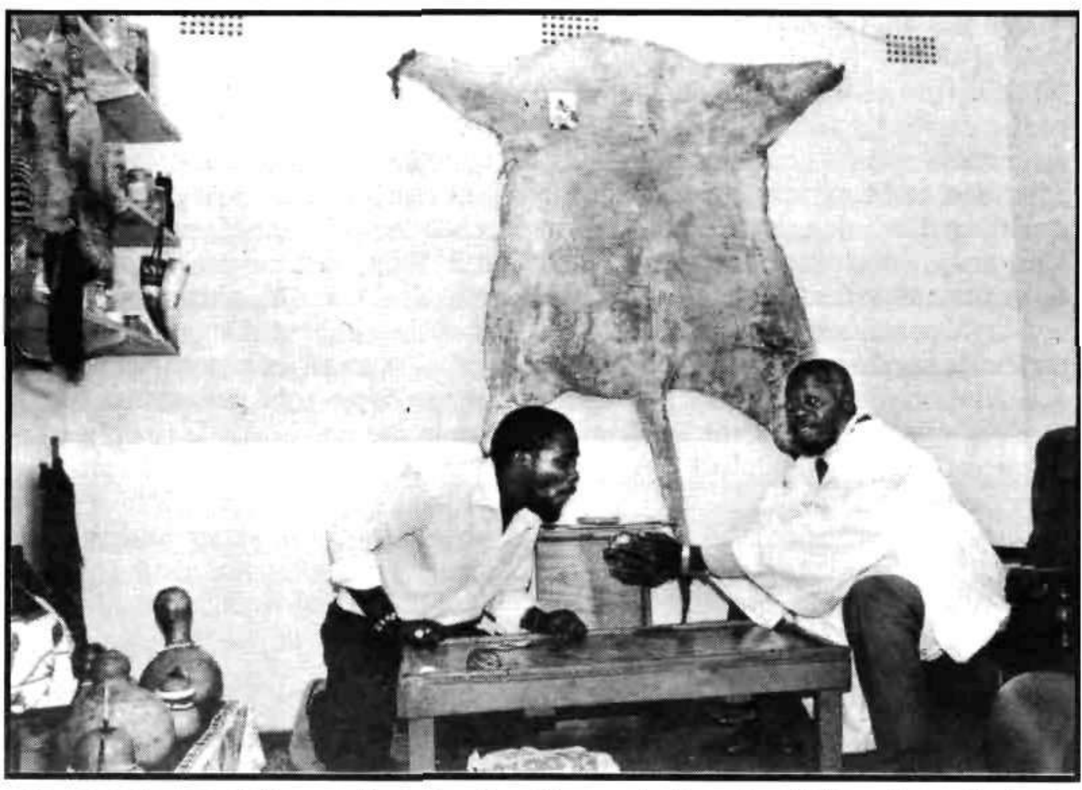
Sangoma in consultation - medical education often negates the value of alternative methods of healing and ignores the world view of the patient