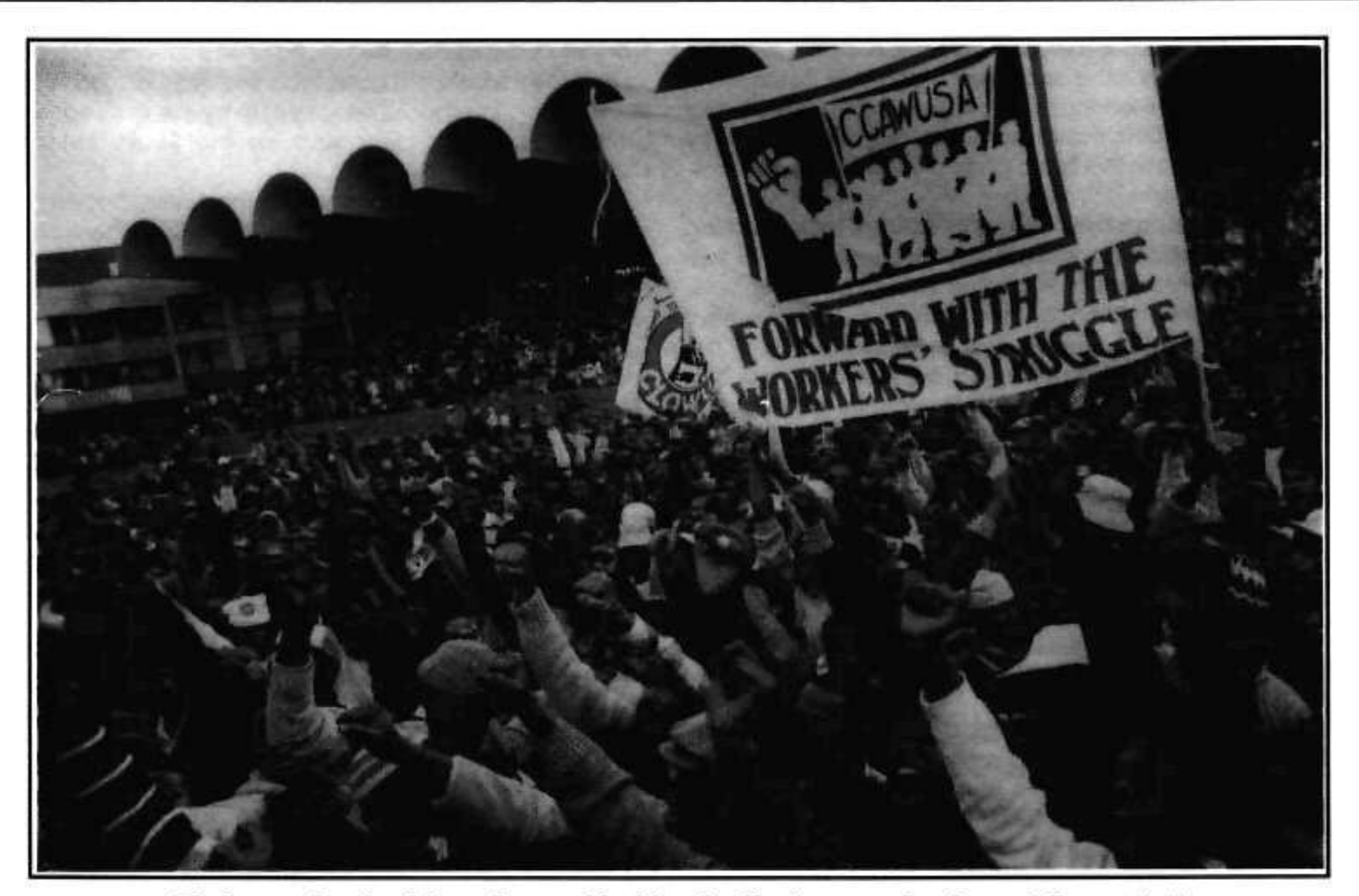
The impact of workers' demands around health and welfare issues needs to be carefully examined.