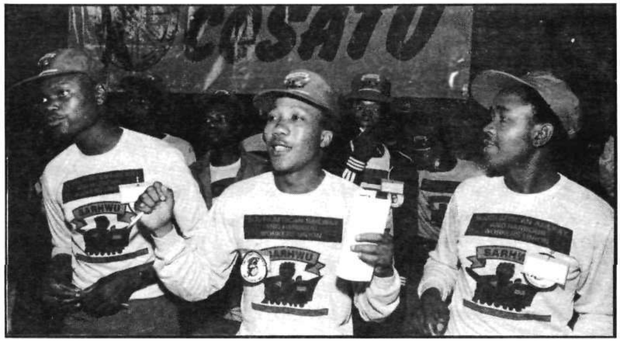
The Network is committed to working together with community organisations such as trade unions, women's organisations and all groups who believe in a democratic society.

The Progressive Primary Health Care Network is a group of health and development projects, health worker organisations and individuals who are committed to an idea which we have called Progressive Primary Health Care or P.P.H.C.