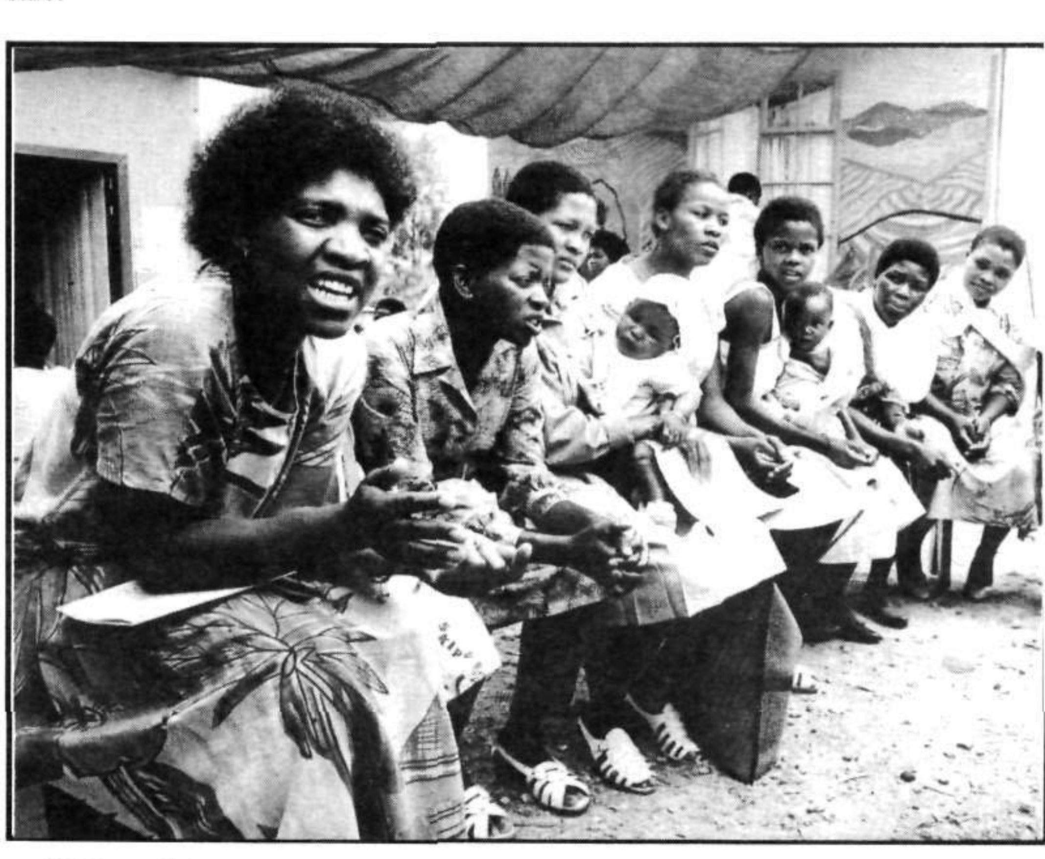
Muldersdrift Clinic - the Network offers assistance and support to existing primary health care programmes and projects.