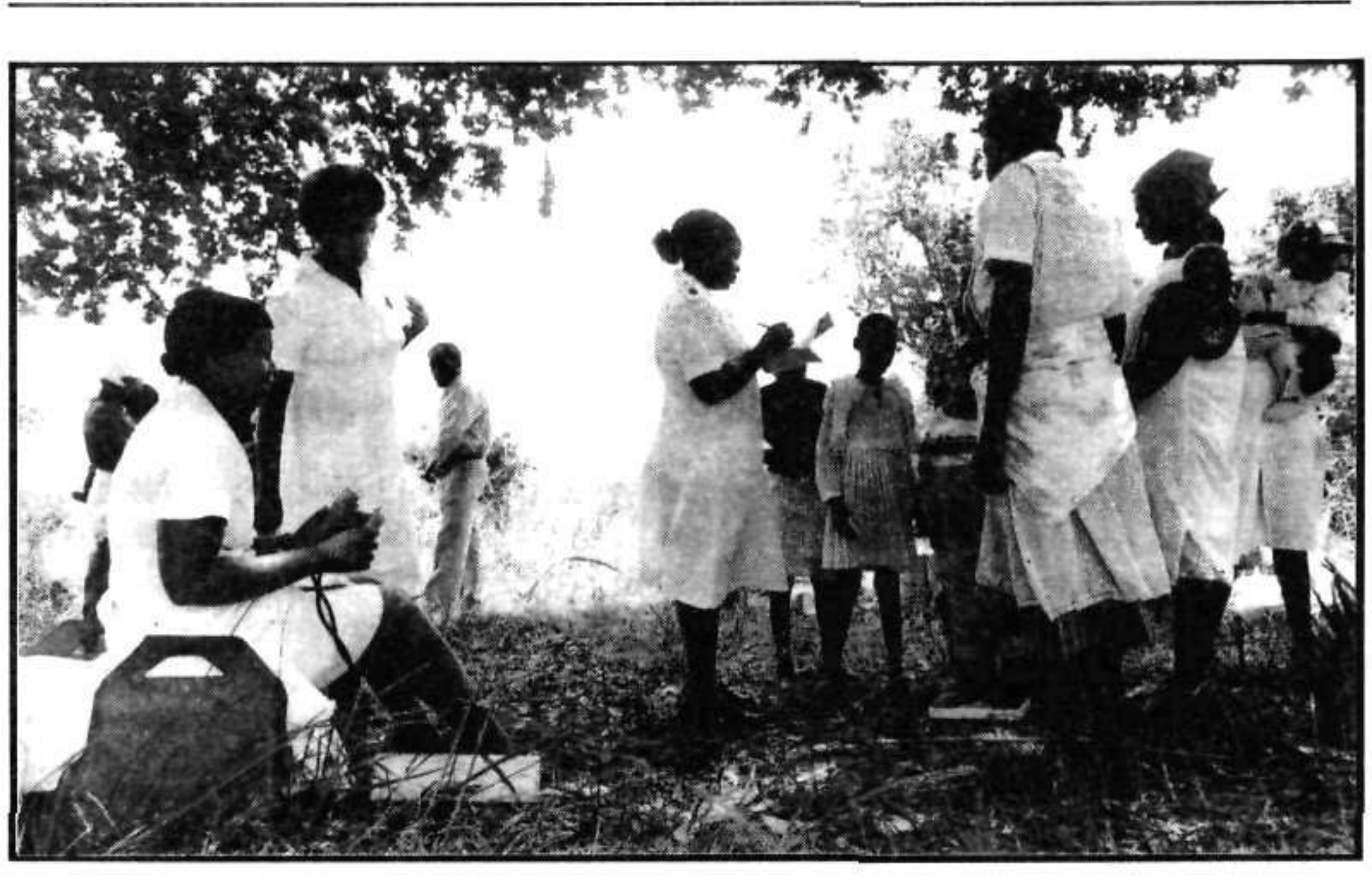
P.P.H.C. encourages health workers to show respect and concern for the people they are working with.

At this first national conference the need for a national network to promote PHC was identified. After extensive consultation at local and regional levels throughout South Africa, a second national conference was held in September 1987 and the National Progressive Primary Health Care Network was established. The network includes the five main regions of the Western and Eastern Cape, Northern and Southern Transvaal and Natal, each of which is represented on a national co-ordinating committee.