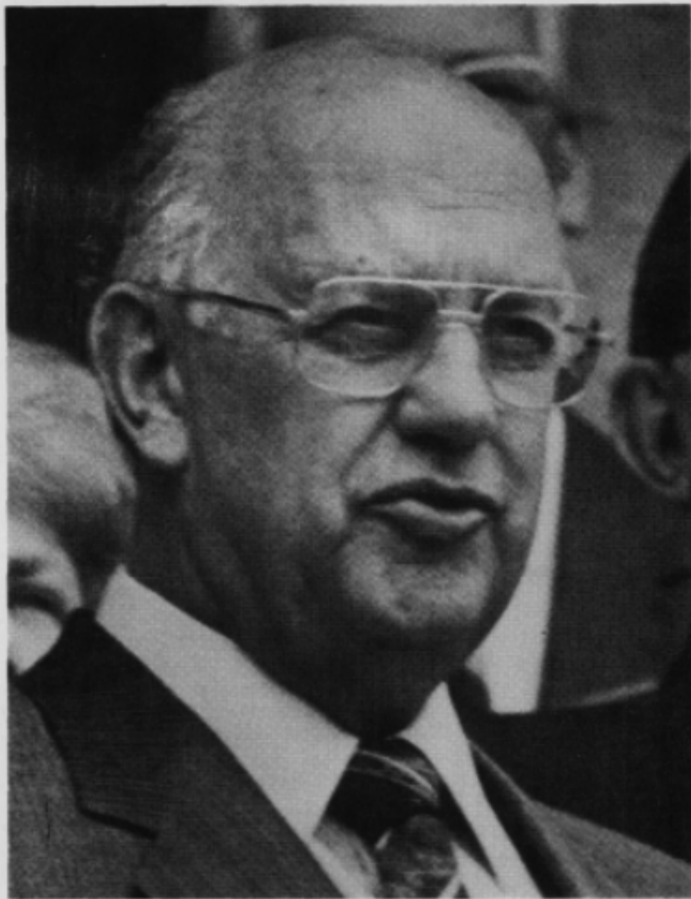
The State President, Mr PW Botha. "... open discussion to improve communication ..."