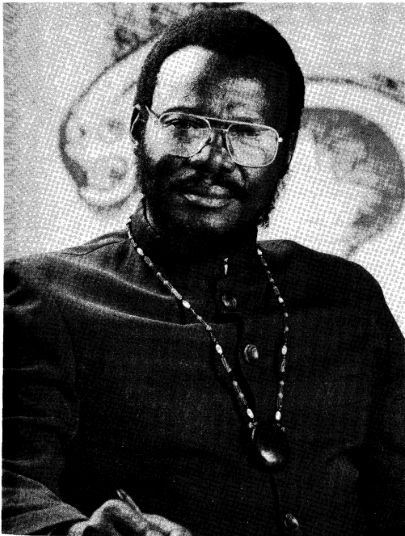
Dr M.G. Buthelezi, President of Inkatha