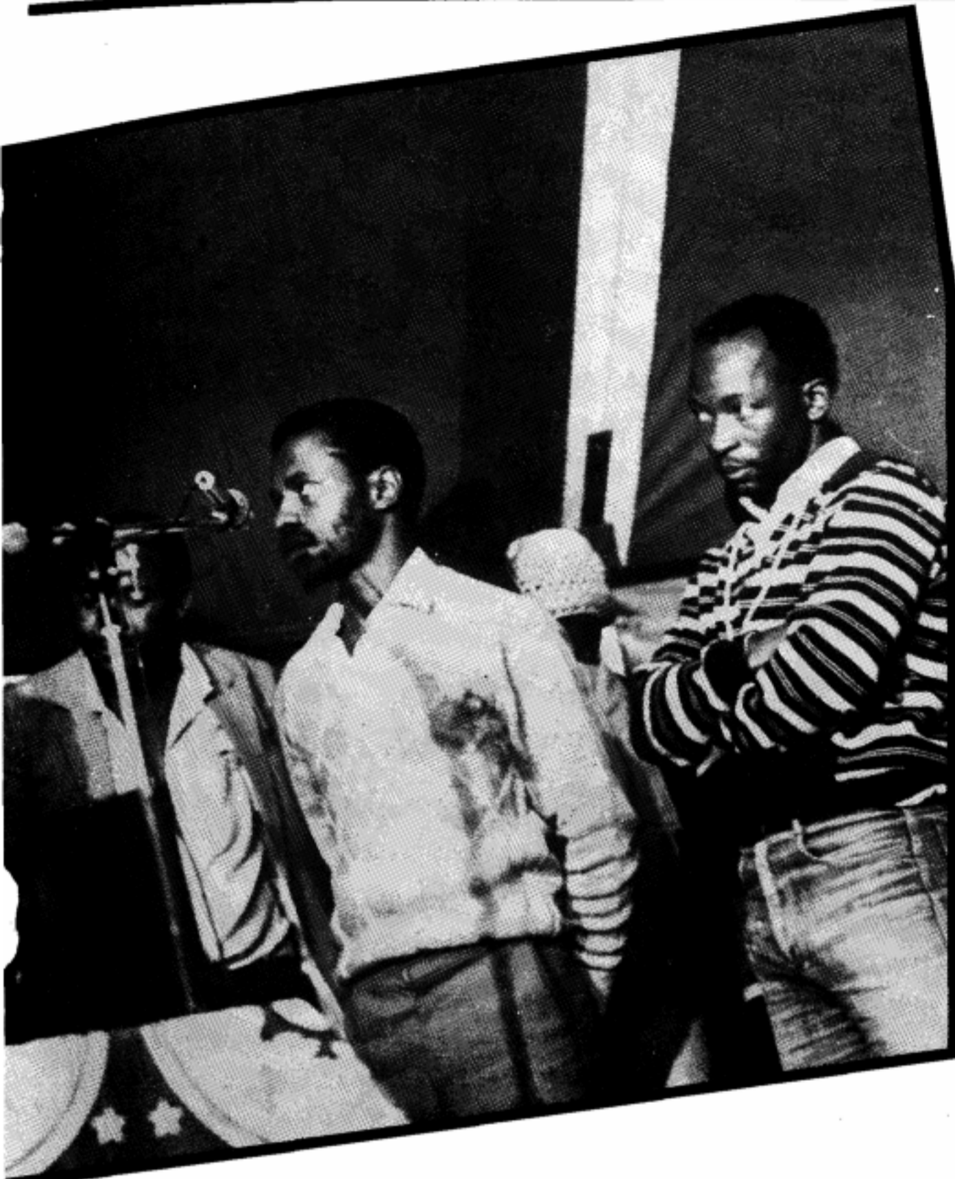
Chief Buthelezi left, policemen centre, informer right.