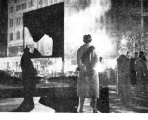
The Damaged Poster