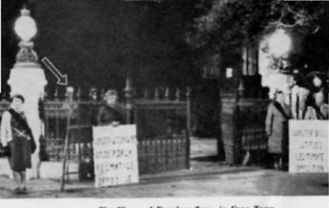
The Flame of Freedom flares in Cape Town