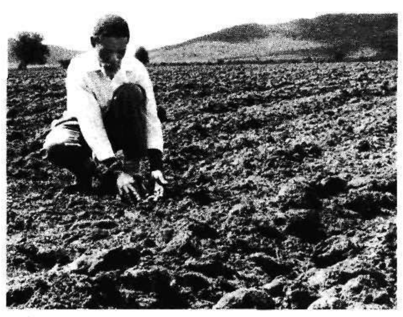
We have lived and farmed at Braklaagte since 1906.