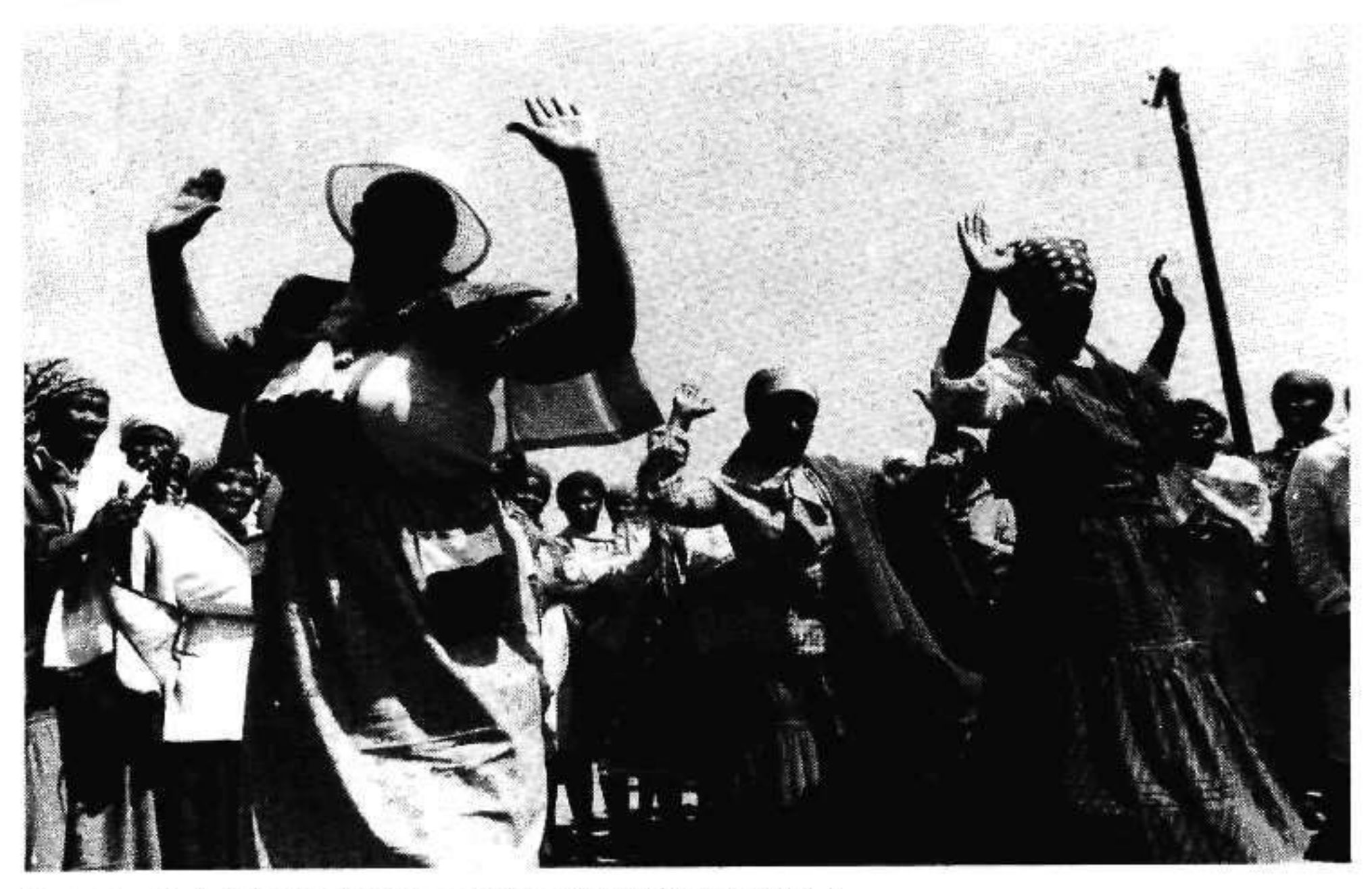
We were very glad that we would be secure in our country as a result. \Delta