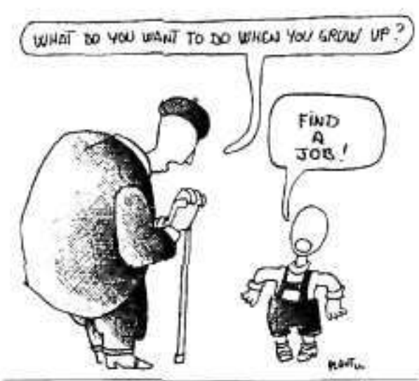
Plantu in Human Rights Questions and Answers © UNESCO 1981.

8. I have been against the coal embargo because of the Mozambique mineworkers who are the first to be laid off when the old labour intensive mines are closed and who, because they are foreign migrants, have no