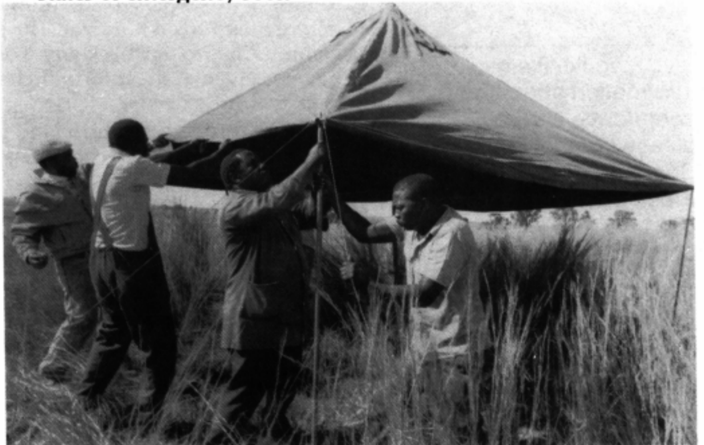
In April 1991 the Cremin community tried to reoccupy their land, but were forced to leave by security forces.