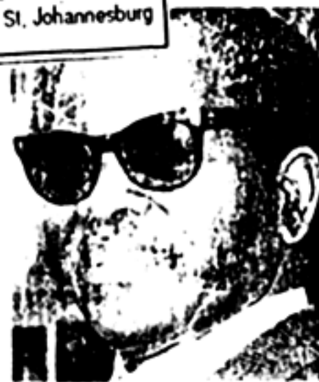
Mr Oliver Tambo

If the ANC is ever to contend seriously for state power in South Africa it will have to do so under the leadership of younger and more vigorous men than Mr Tambo now is.