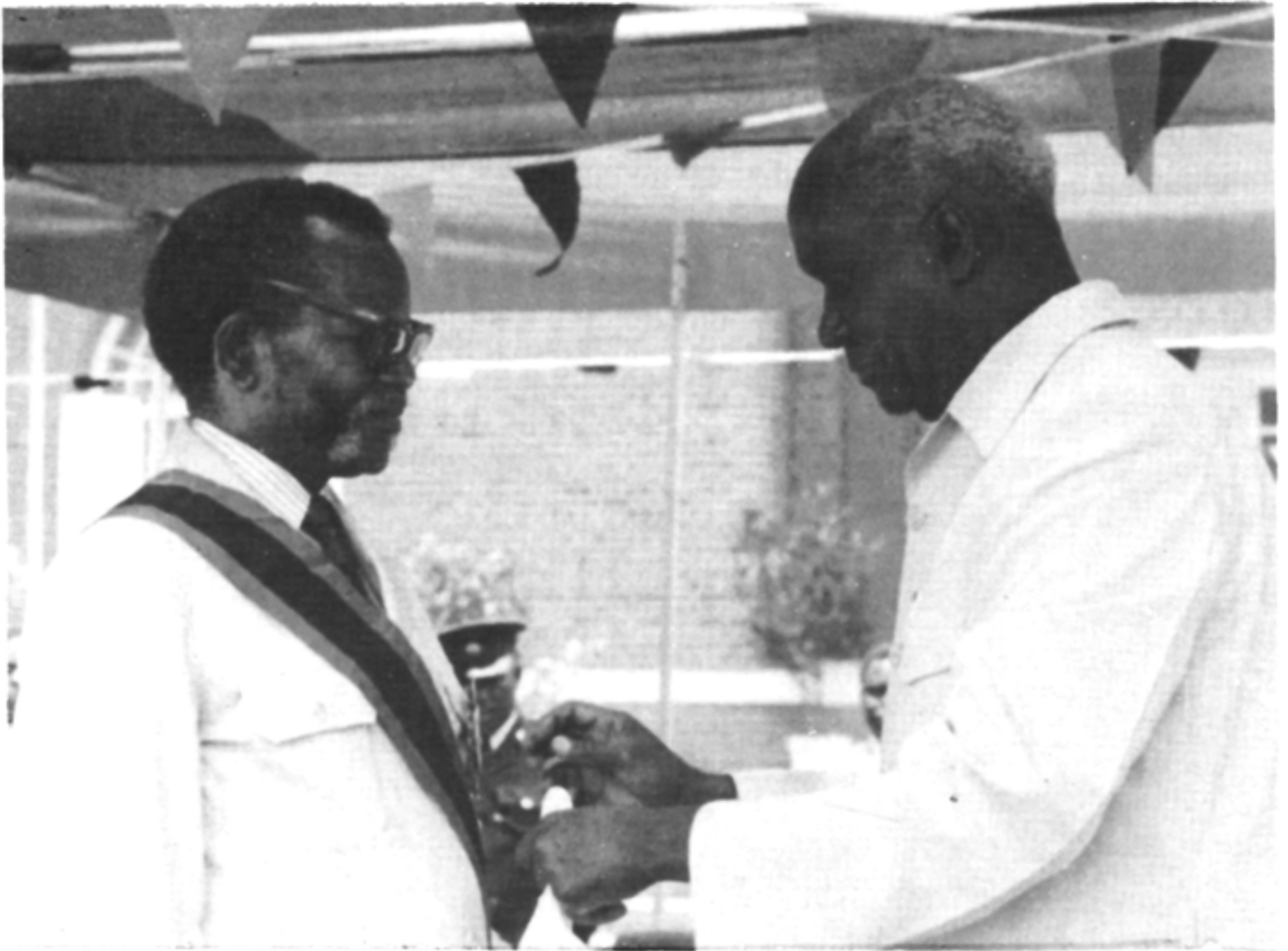
On the occasion of his 70th birthday, President Tambo is awarded the Grand Companion of Freedom (First Division) by President Kaunda of Zambia (above) and the Order of Friendship by Czechoslovakian President Gustav Husak (below)