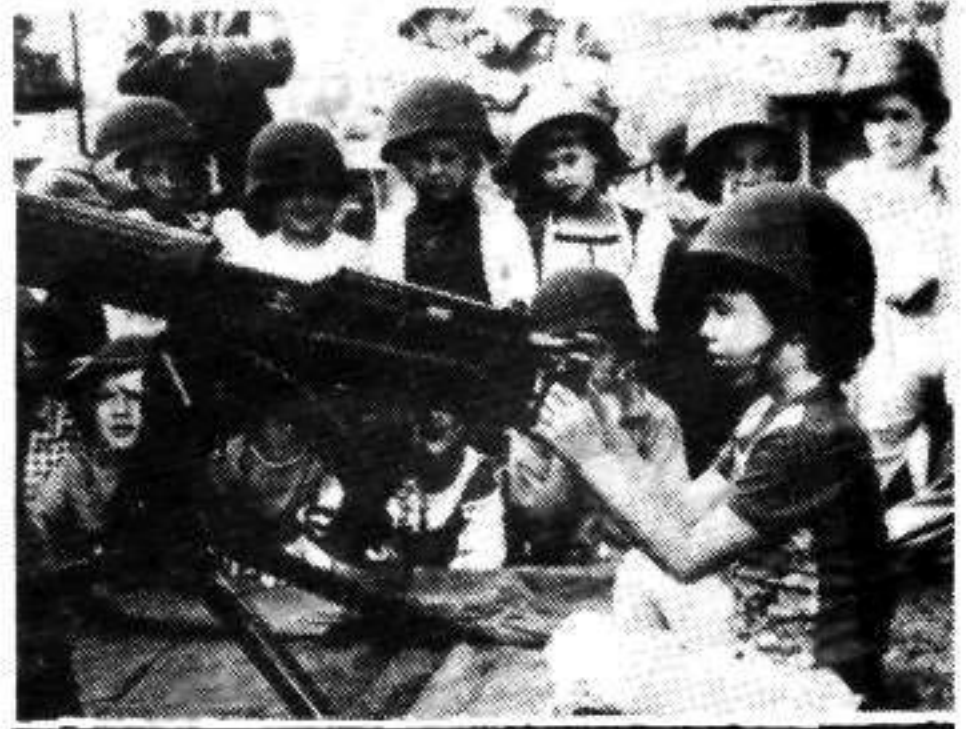
The hearts and minds campaign.

Apart from direct physical involvement in the SADF, white women play other important support roles to the racist army. Competitions like the Sarie Magazine Wooden Spoon — Ons Gee Om (We Do Care) contest have become commonplace. In this particular competition entrants also submit with their cakes (the cakes are later sent to the "boys on the border"), the name of their chosen "boy on the border". Lucrative prizes like 3