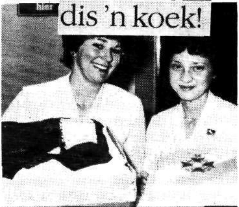
Cakes for the racist soldiers.

Renault 5 cars, and 25 Southern Sun holidays are used to lure as many women as possible into entering.