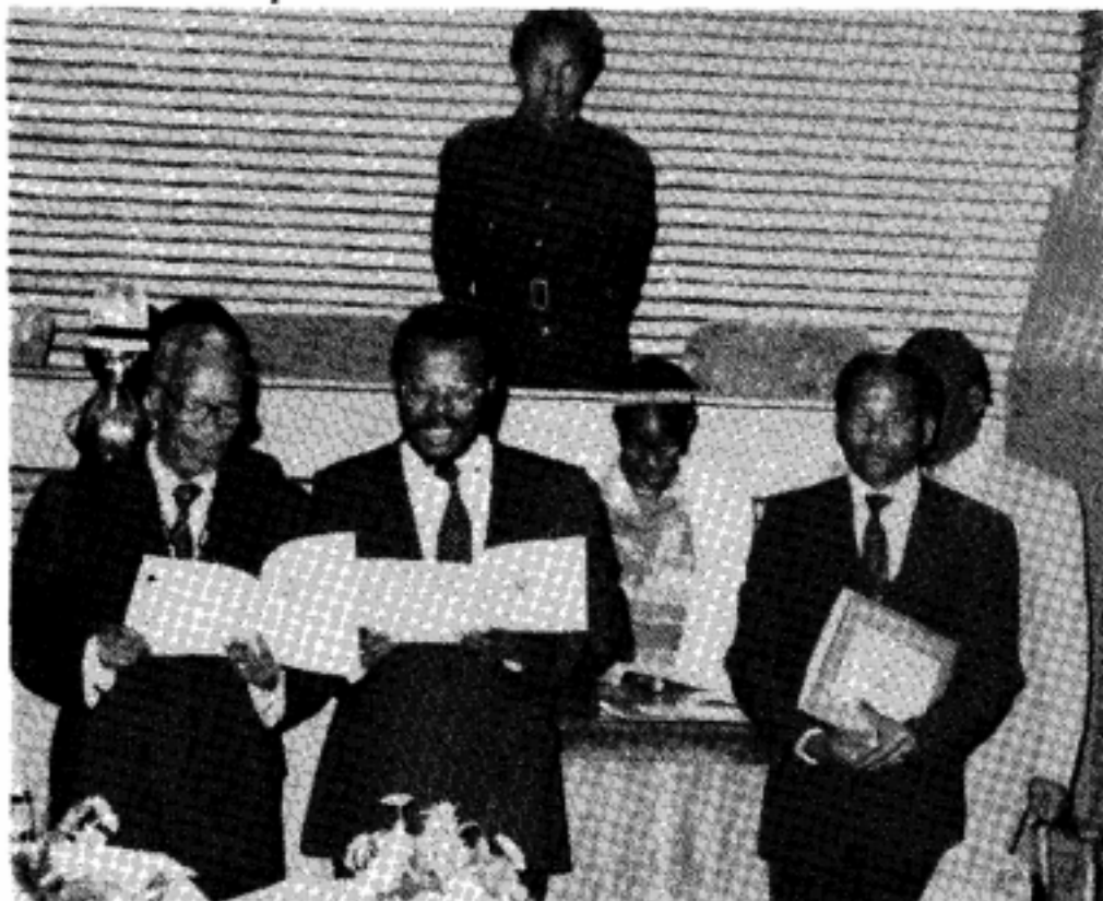
Chief M G Buthelezi and Dr C M Phatudi.

Believing as we do in the democratic right of any people to order the future of their country as they see fit, we undertake, together with the people, to explore all possibilities open to us. We have decided to explore federalism, amongst other options, as a possible compromise solution if it is accepted by the majority of South Africans. We do not prescribe this to the people of South Africa. But we consider it to be a viable option based on the knowledge that the great democracies have successfully employed principles of federalism to achieve a free and united society. And we do this in the fervent hope that White racial fears will be allayed and that Black and White together will ever increasingly be brought to work with each other to create a society in which no race group fears any other race group, and in which no race group will seek to dominate any other race group.