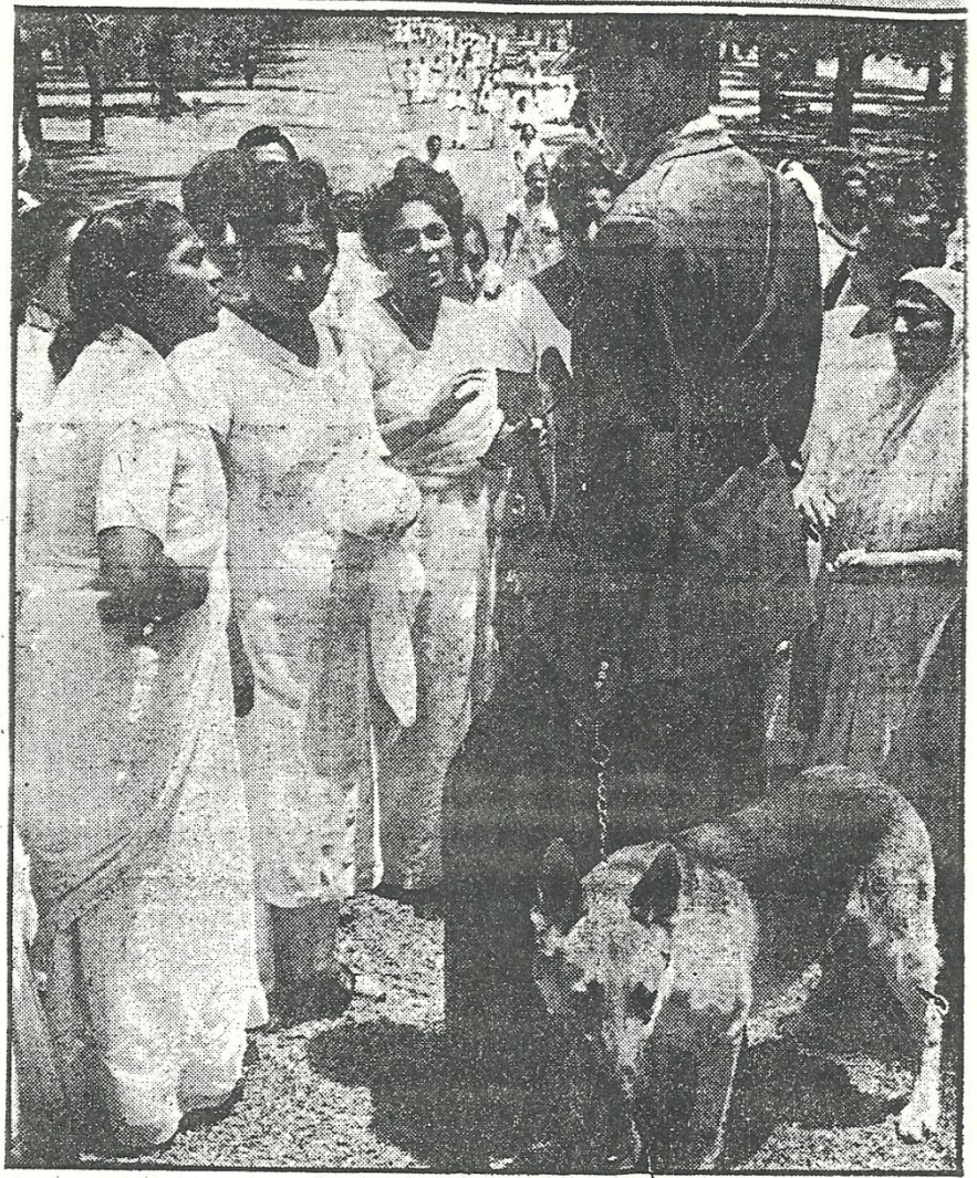
A police constable, with his dog, talks to a crowd of Indian women who entered the Union Building grounds yesterday. Several dogs were used to force the women away.

Verwoerd read: "The ruthless application of the "The ruthless application of the policy of apartheid is causing grave concern to our people. Its implementation in the form of group areas, job reservation and other measures involver loss of homes, impoverishment and assault on our dignity and self-