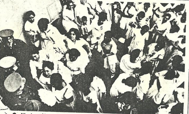
Wearing white saris, the women came from all parts of