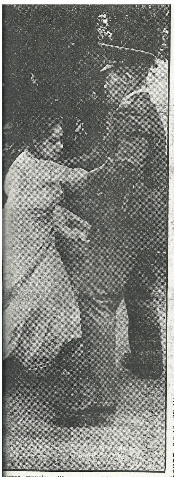
ceman grapples with an woman. Hundreds men were trying to the Union Buildings a protest against the Areas Act yesterday.