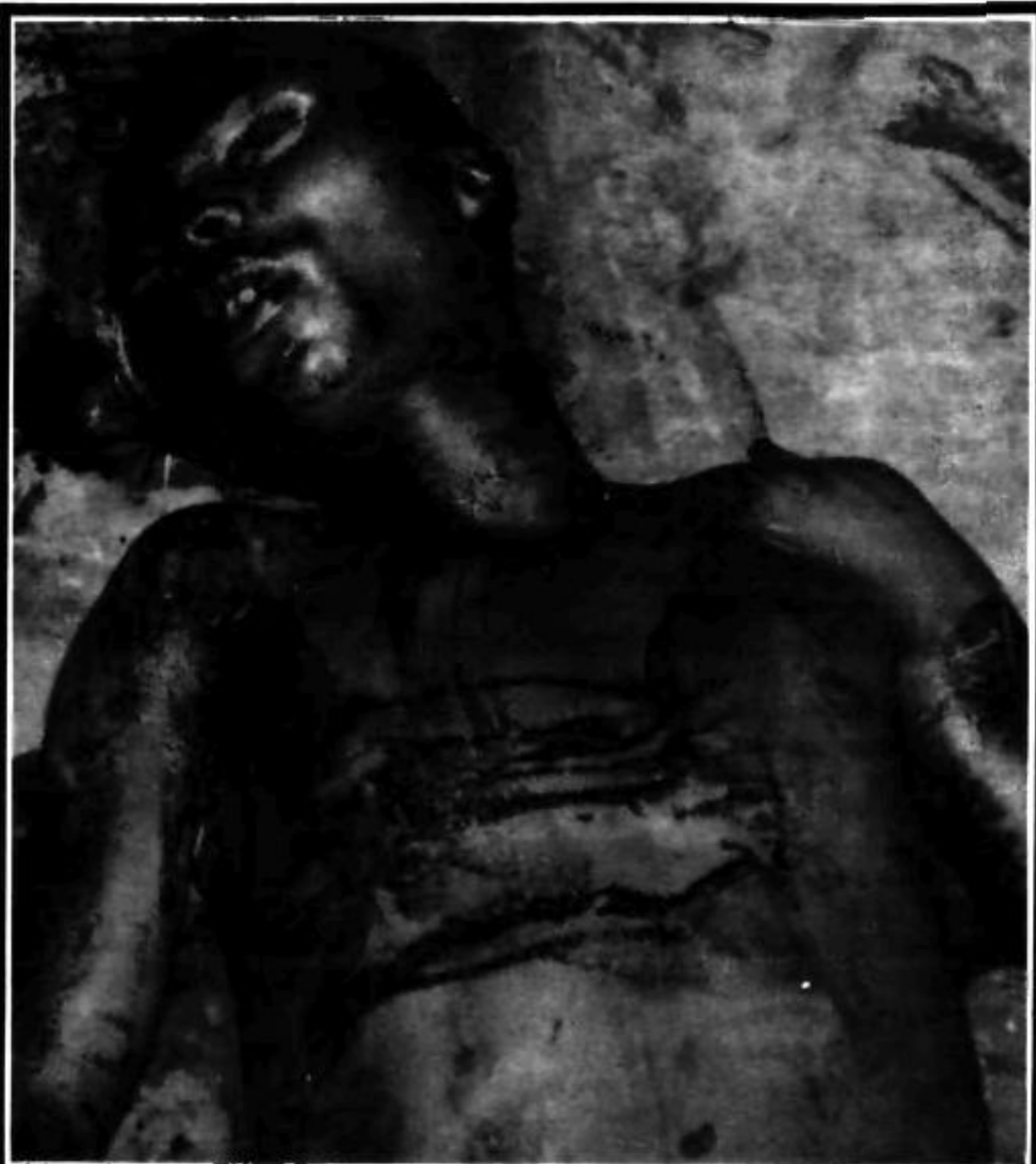
After the massacre

Within a federation of Southern African workers' states, the divisions and inequalities created by capitalist rule could finally begin to be overcome.