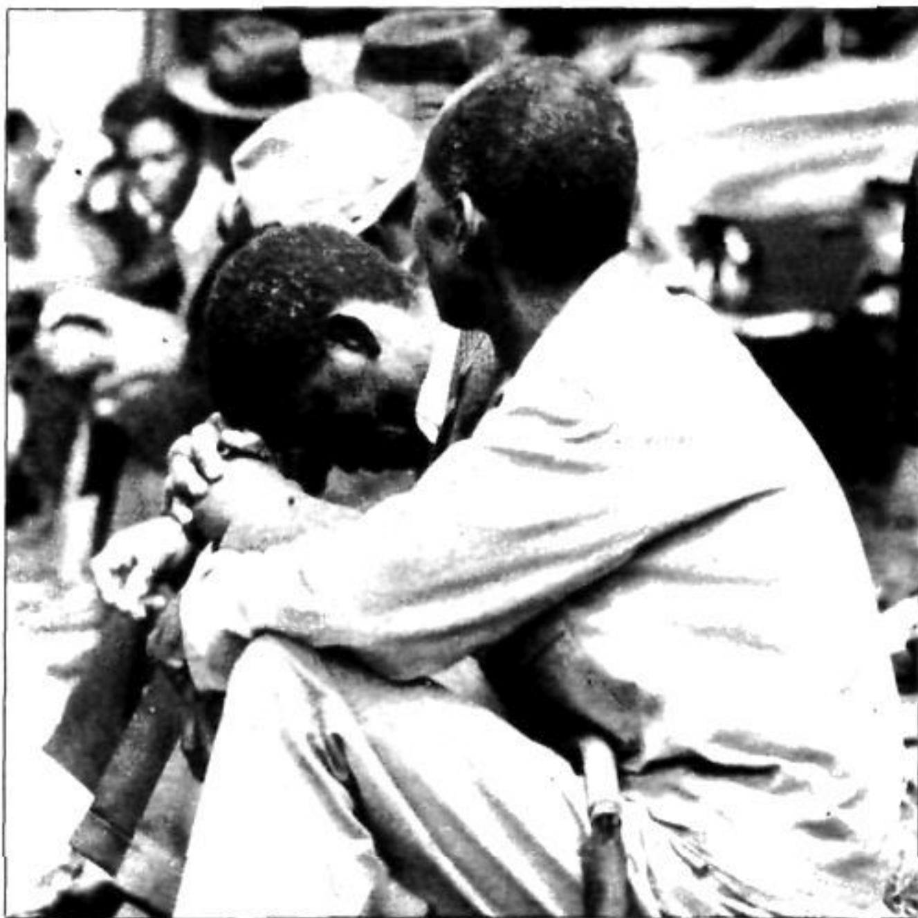
Three million working people in SA suffer the despair of unemployment

fortunately, has been echoed by some trade union leaders who see import controls as a way of saving SA workers' jobs.