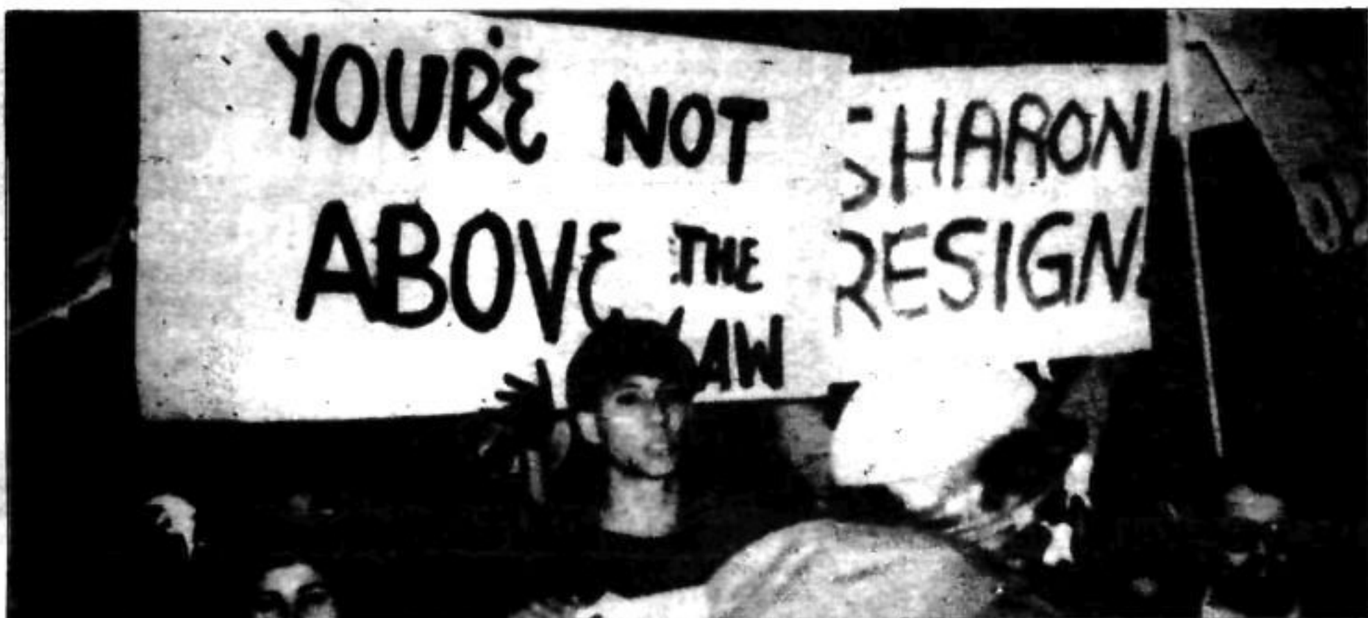
The Beirut massacre brought out deep splits in Israeli society.

landlordism could begin to be eliminated. Poverty could be alleviated, and privilege abolished, by placing production on a planned basis under the control of the working people.