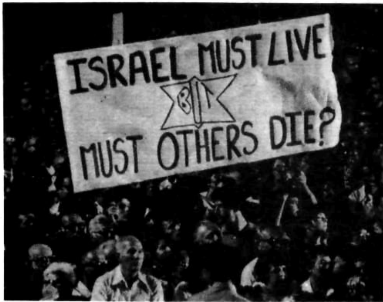
Massive anti-war demonstrations took place in Israel during the invasion of Lebanon.

decisive phase. So powerful was the attraction of the revolutionary movement that the Syrian-controlled Palestinian forces disintegrated and crossed en masse to their brothers and sisters.