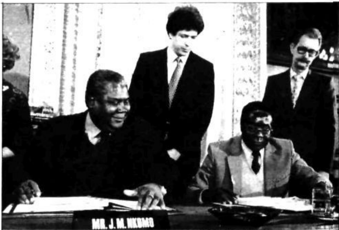
Signing the Lancaster House agreement in 1979.

The way forward for ex-guerillas is not through despair, but in becoming part of the organised ranks of the working class struggling for a socialist future.