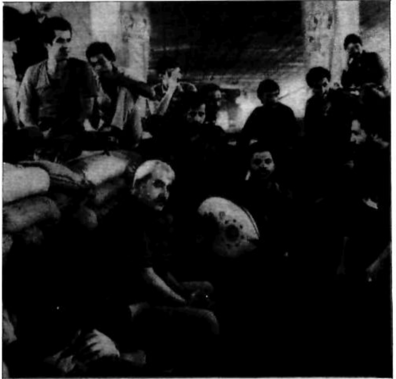
PLO activists, looking for a revolutionary way forward, have been trapped in exile guerilla camps.

1 300 000 Palestinians inhabiting the West Bank and Gaza have been brought under Israel's rule, greatly diluting the preponderance of the more than three million strong Jewish population on which the power of the ruling class depends. The people of