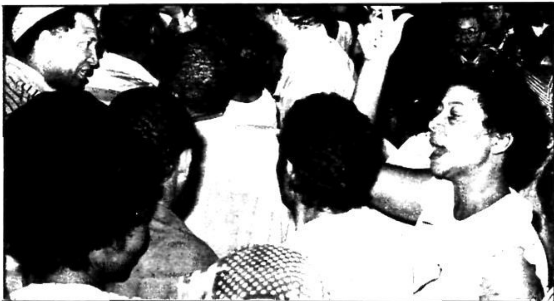
Workers reject 'Labour' leaders' plans for class collaboration at stormy meeting

That was the task carried out by the Russian working class in October 1917.