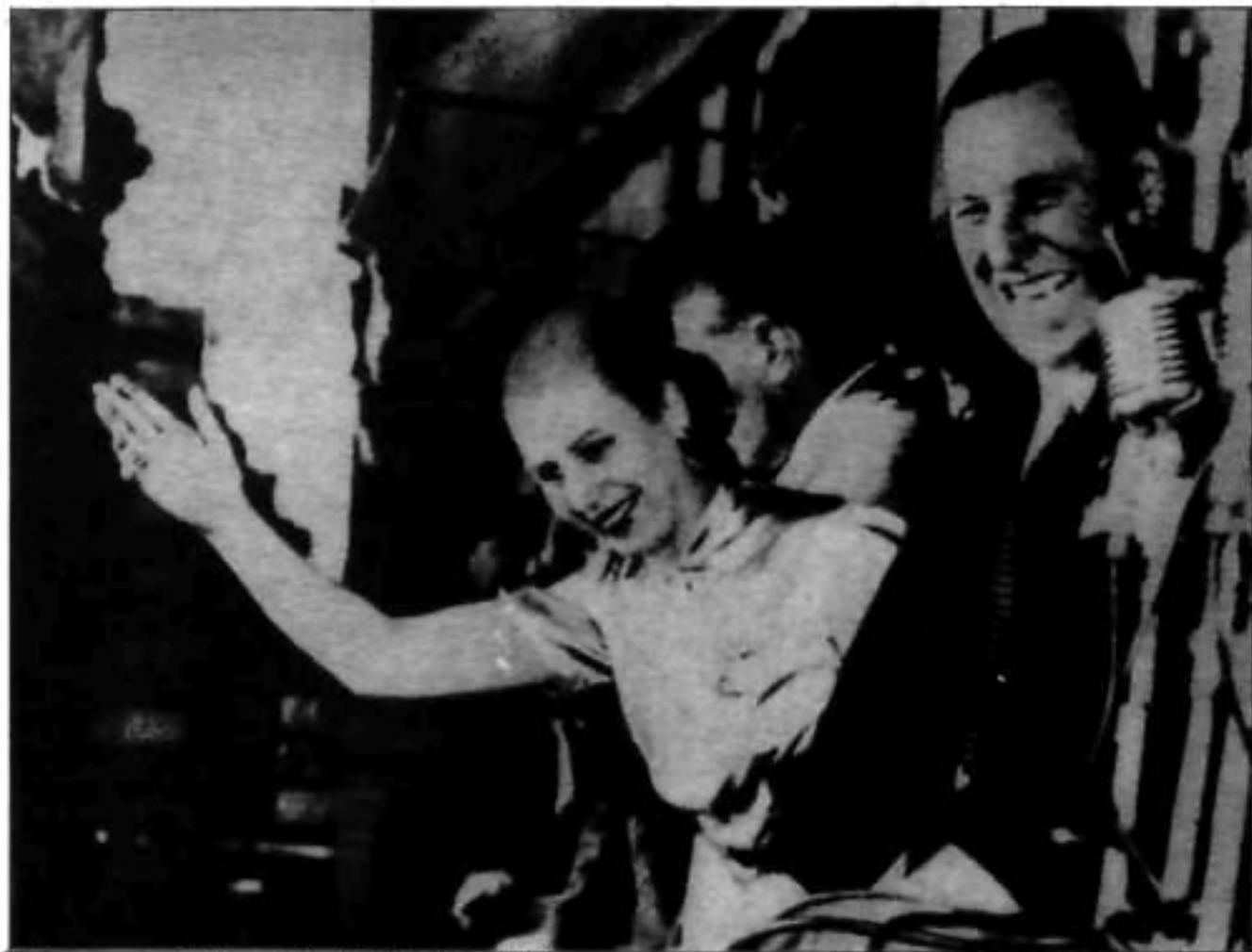
Peron and his wife Evita in 1952

But these capitalist Napoleons find themselves faced with the same crisis