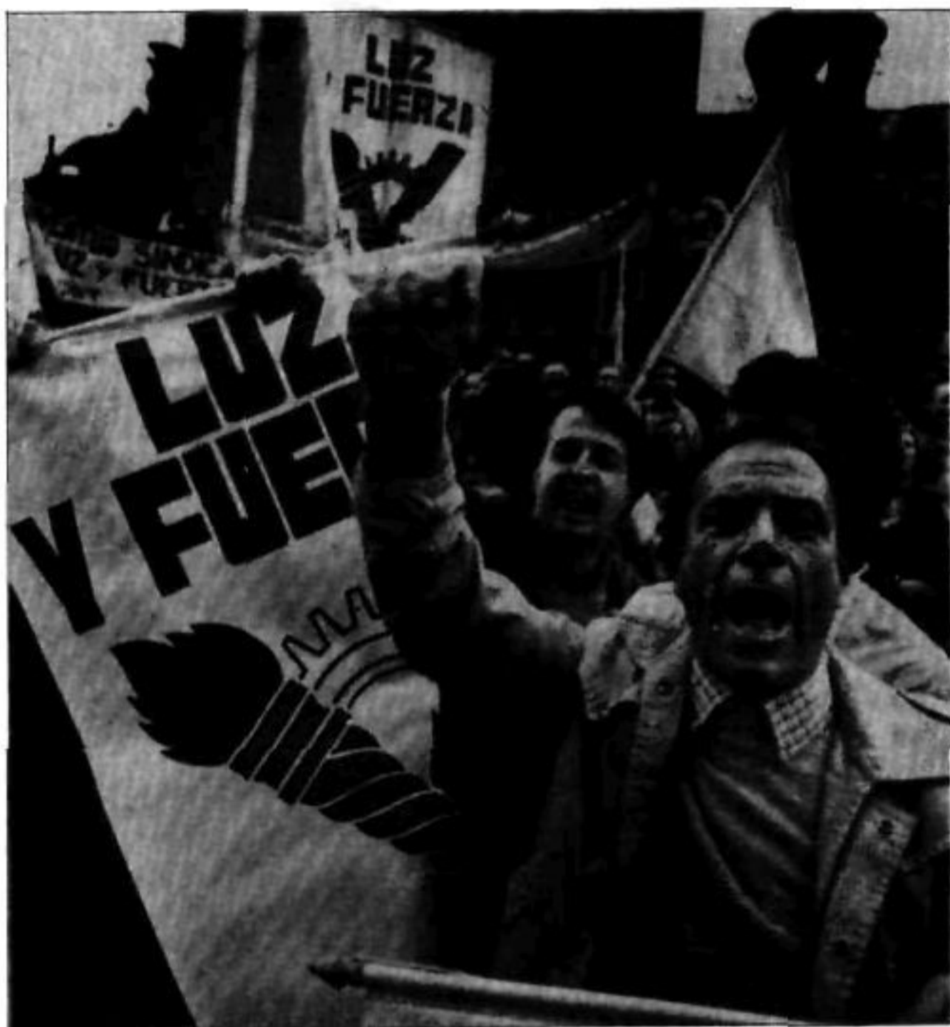
Argentinian trade unionists demonstrate against the junta

had spent the previous months trying to arrange secret pacts with various military leaders.