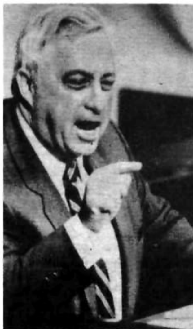
Sharon—dropped as Defence Minister but still in the cabinet.

An Israeli soldier describes the mood within the army: "You clean out one apartment block and before going on to the next one, while you are resting, an argument breaks out: yes PLO, no PLO; yes a just war, no