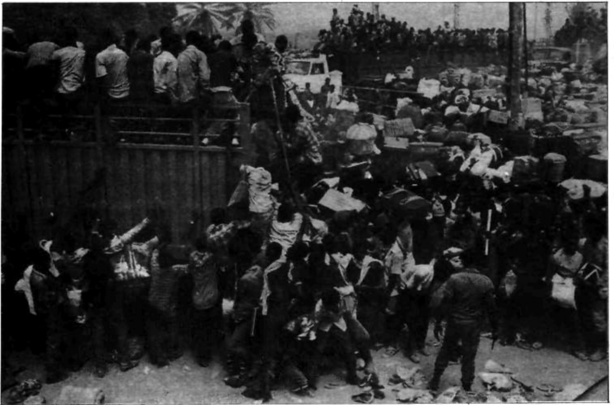
Lagos port: thousands of 'strangers' try to get away