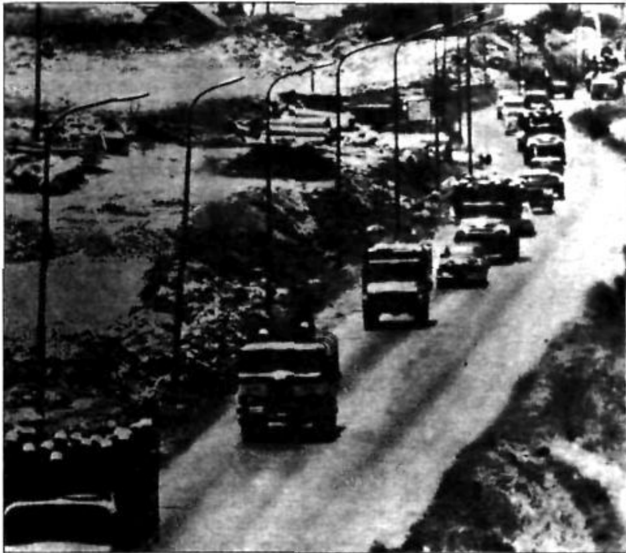
1976: Syrian troops pour into Lebanon to prevent victory by the Palestinians and the left.

focal point of struggle against both Zionism and Arab reaction, carrying the movements of 1970 and 1975 to their logical conclusion. For these reasons the Arab regimes pay mainly lip service to the idea of an independent Palestinian state.