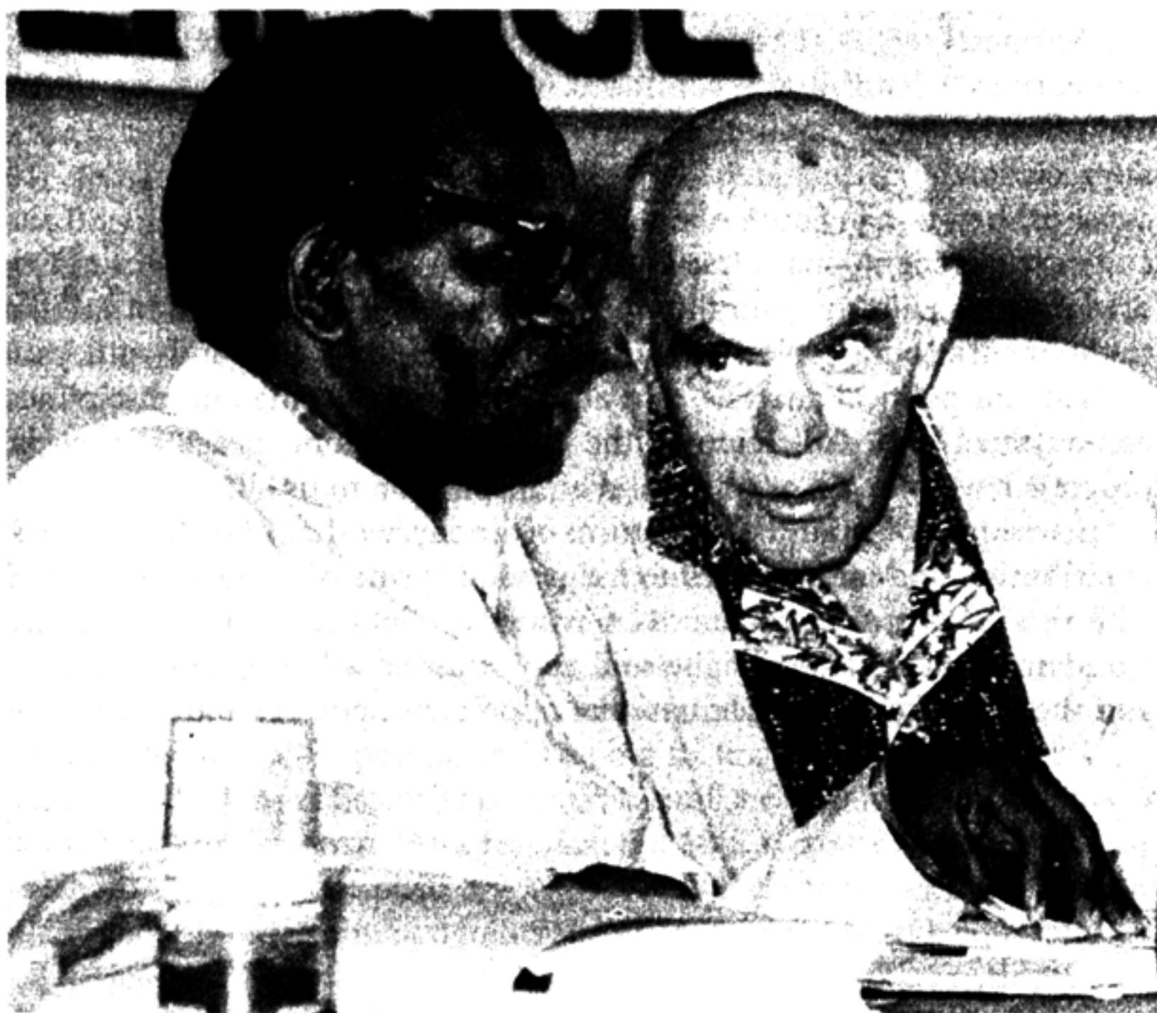
Jack Simons in conversation with ANC President Oliver Tambo at the 1985 ANC consultative conference in Kabwe, Zambia.

is still merely pie in the sky, an illusion to distract attention from the battlefield and enable the ruling class to cling on to power. There is no point in working out artificial solutions until the back of the apartheid regime has been broken and the people are in a position to seize power. Then, when all parties have realised the strength of our cause, the time will come to sit down at the negotiating table and draw up a plan for the South Africa of our dreams.