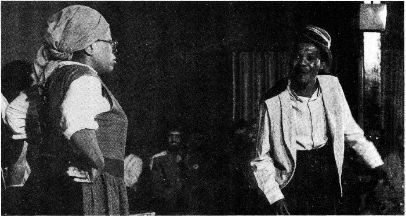
Junction Avenue Theatre Company in "Marabi"

trumpet or the poem, and on the other that nothing but aggressive political action could have any substantial effect on events. Lines from Arthur Nortje quoted in the opening speech opened this theme: