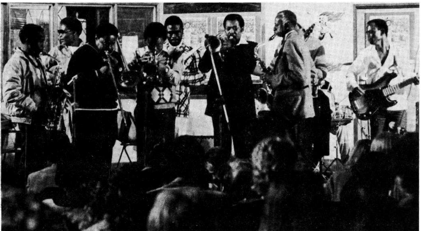
Jazz concert with Hugh Masekela

Every pleasure had its obverse in its relationship to the abominable South African systems which we were temporarily free from or permanently proposing to resist, but for artists this temporary freedom must surely have been revitalising. Those who usually live within the horrors and constraints of Apartheid stayed for a little time with those who usually lived within the agonies and constraints of exile, and for both it must have been a tiny mutual glimpse of liberation. □