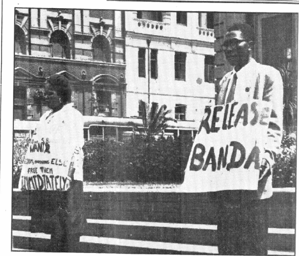
"RELEASE BANDA" said a poster carried by a demonstrator of the ANC Youth League on the Johannesburg City Hall steps last week. (For full story on Nyasaland, see page 4.)

What special influence has this man? What passport gives him access to every public figure of any note. (Continued on page 6)