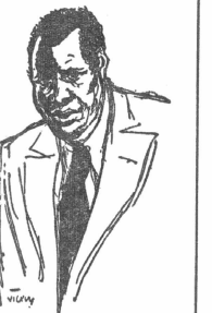
After Britain, Robeson has a heavy schedule ahead of him. Tens of thousands of people look over his shoulder in Europe and Asia are due to hear his rich, resonant bass voice in his moving programme of folk and peace songs from all over the world.

Not only are concert managers all over the country after him—he has already made several appearances on television, and plans are under way for him to appear at Stratford on Avon as Othello.