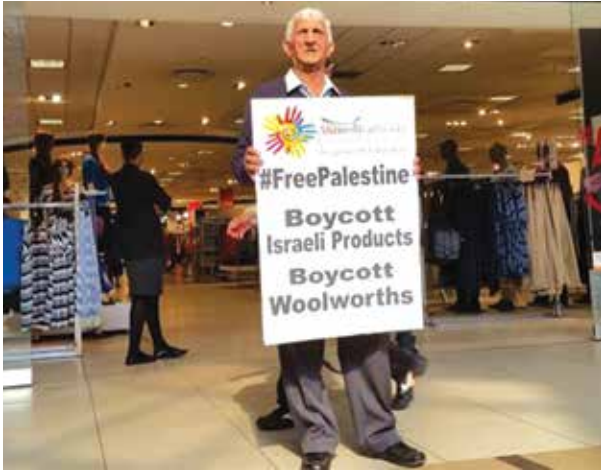
Isu protesting in favour of a boycott of Israeli goods.