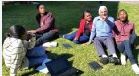
Isu joins staff outside the Foundation's offices for an informal meeting.