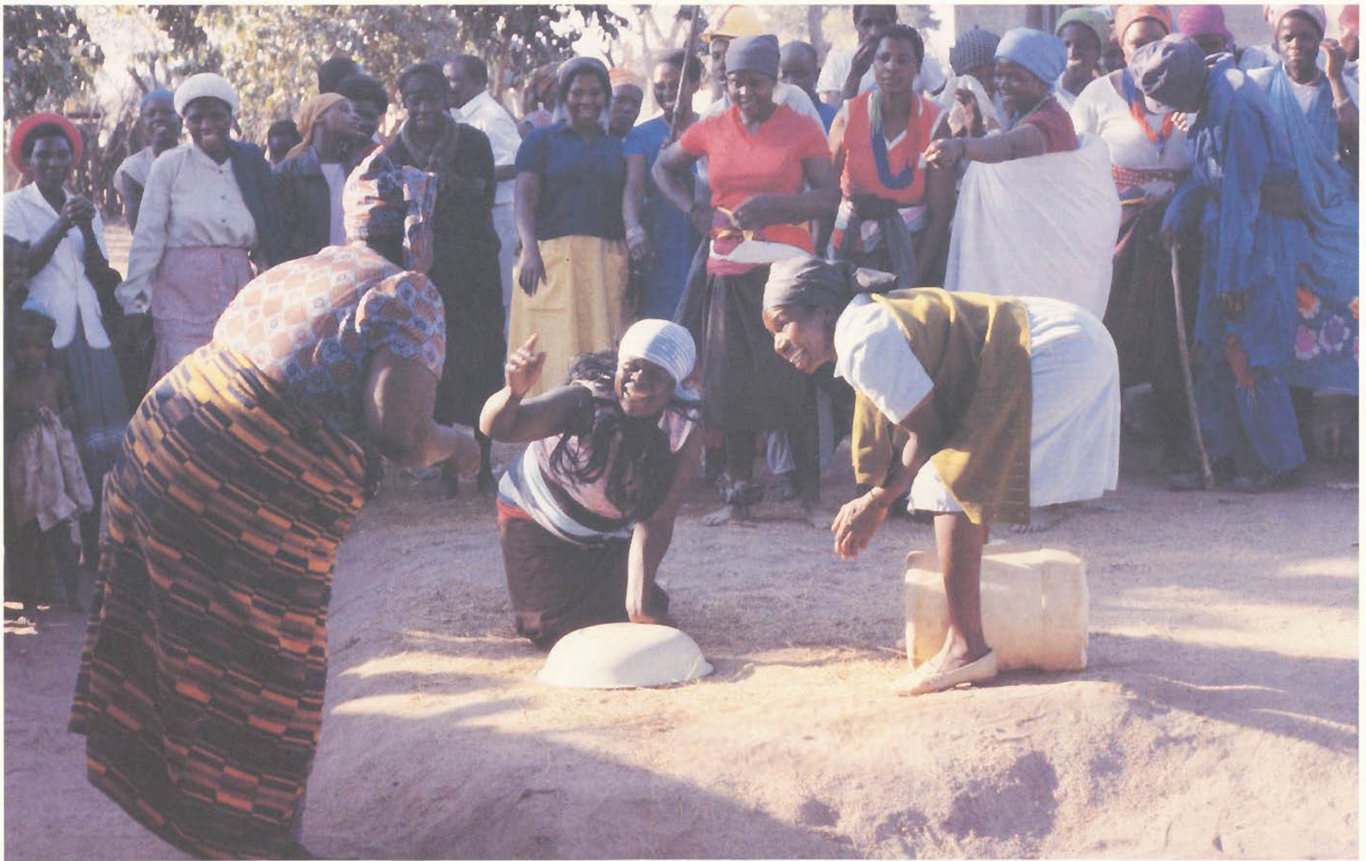
Sejwana sa go hlapela le kgamelo ya meetse ge di šomišwa di dira meropa e botse ge go be go binwa kopanong kua Athol.