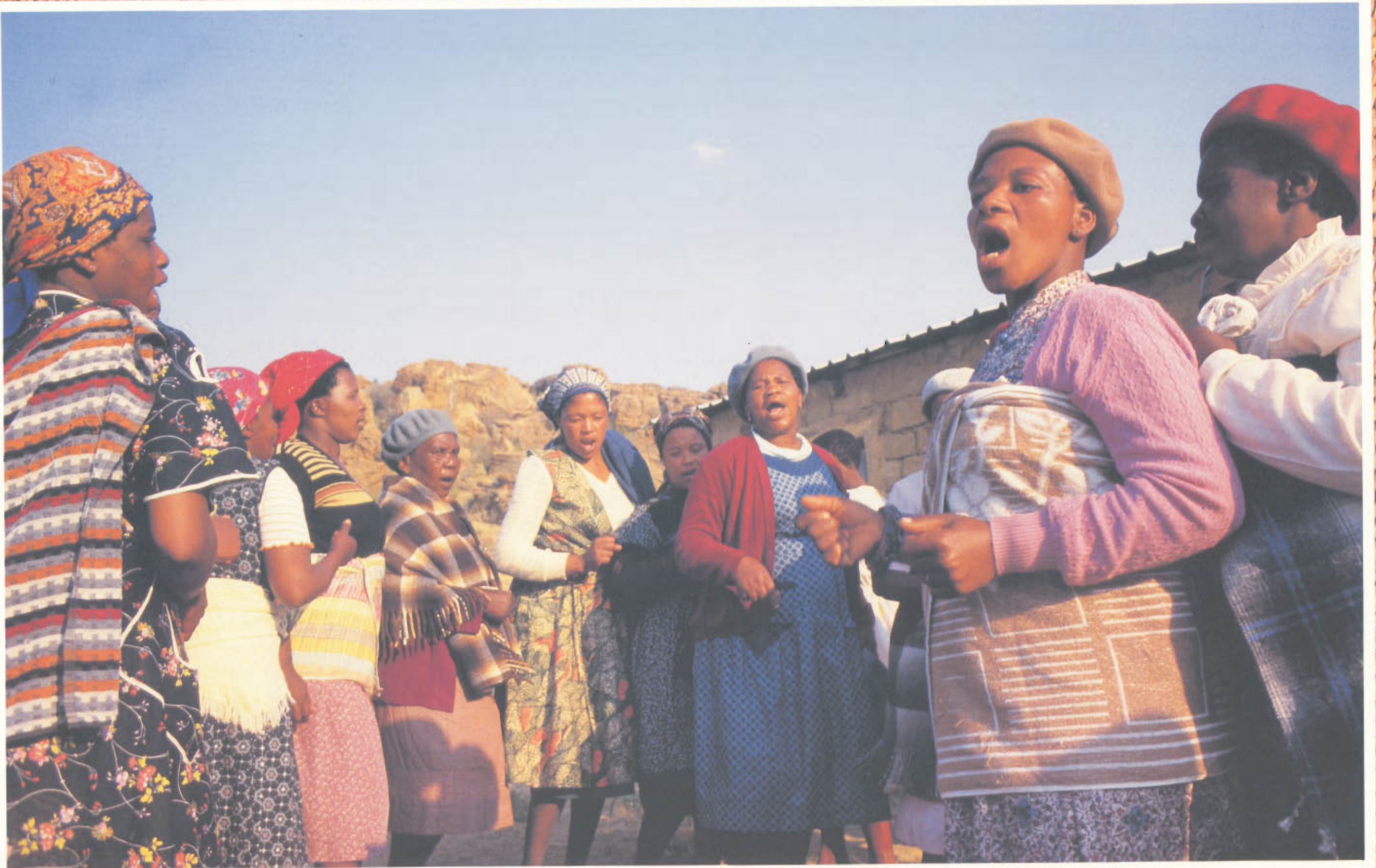
Maloko a mokgatlo o moswa wa Sikhisazana ba tšwa kopanong ba opela dikoša.