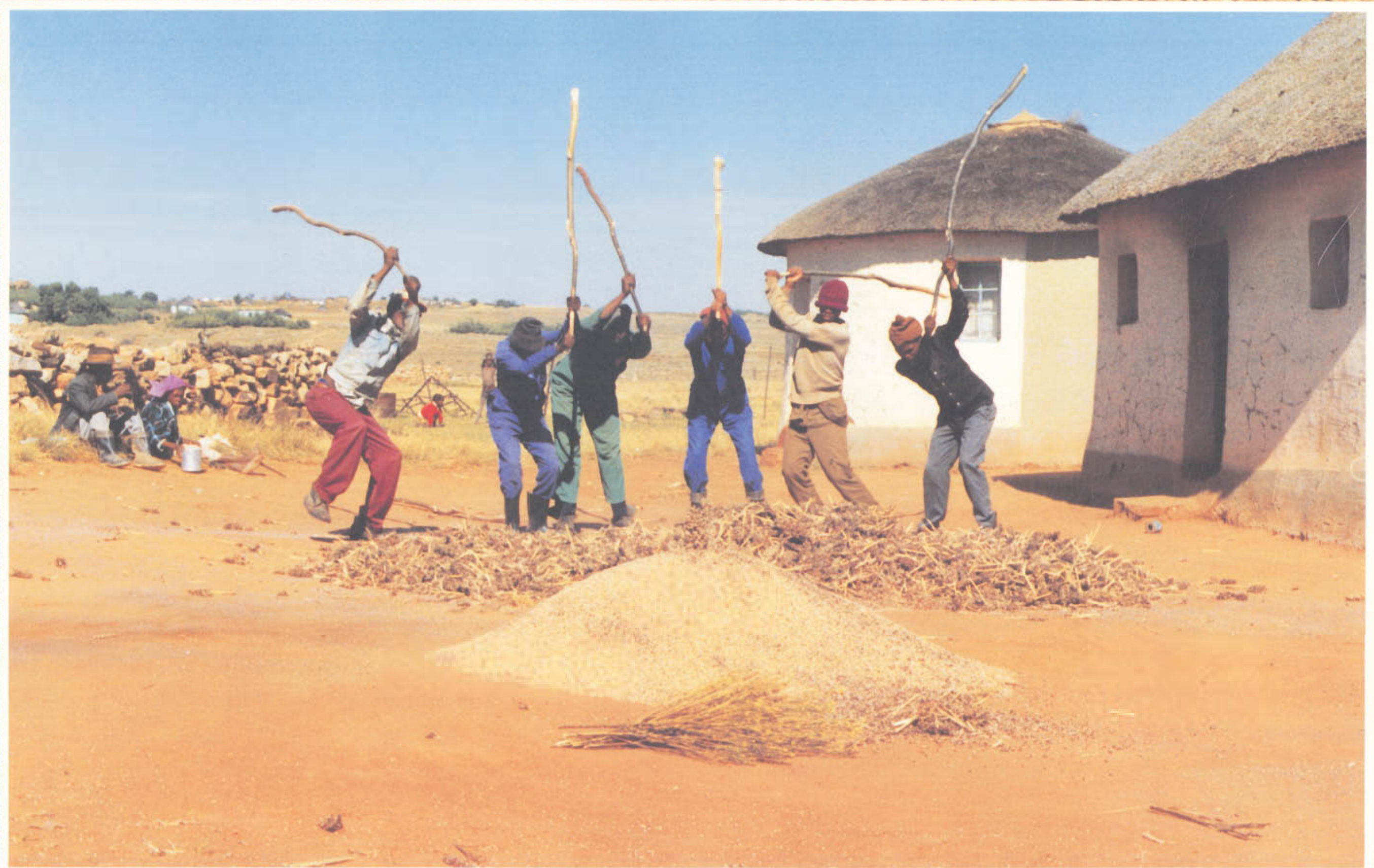
Go folwa mabele Mehloloaneng.