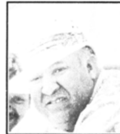
Kriel's Minister of Education, Abe Williams