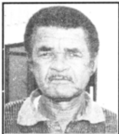
Kriel's Minister of Housing, Johnson Nxobongwana