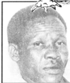
Kriel's Minister of Justice, Mali Hoza