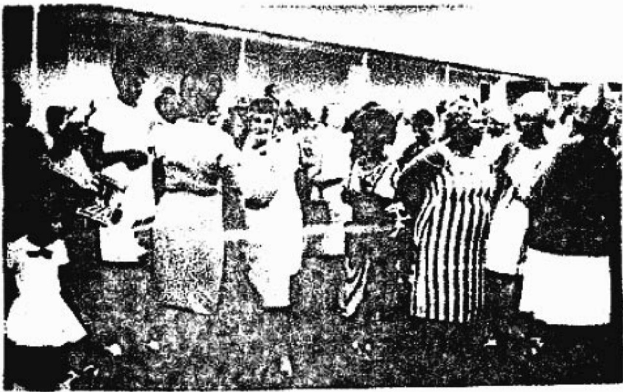
Left: Women sharing their impressions of the meeting.