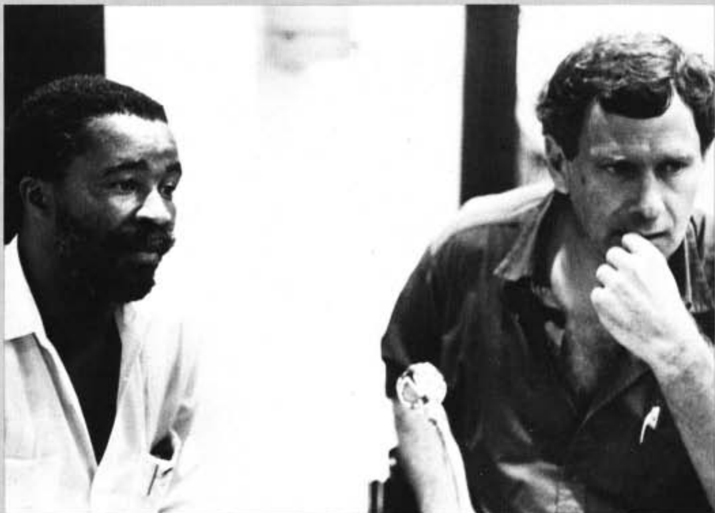
Mr. Thabo Mbeki and Dr. van Zyl Slabbert, the respective leaders of the two delegations.