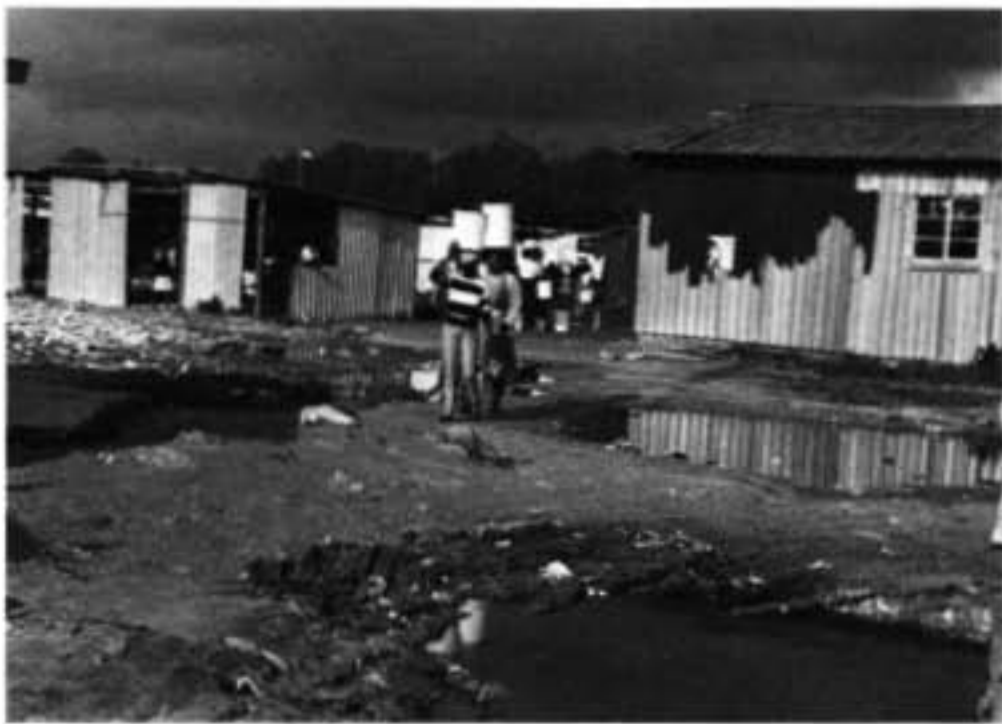
A typical "street" scene in the KTC squatter community, characterised by green pools of polluted water.