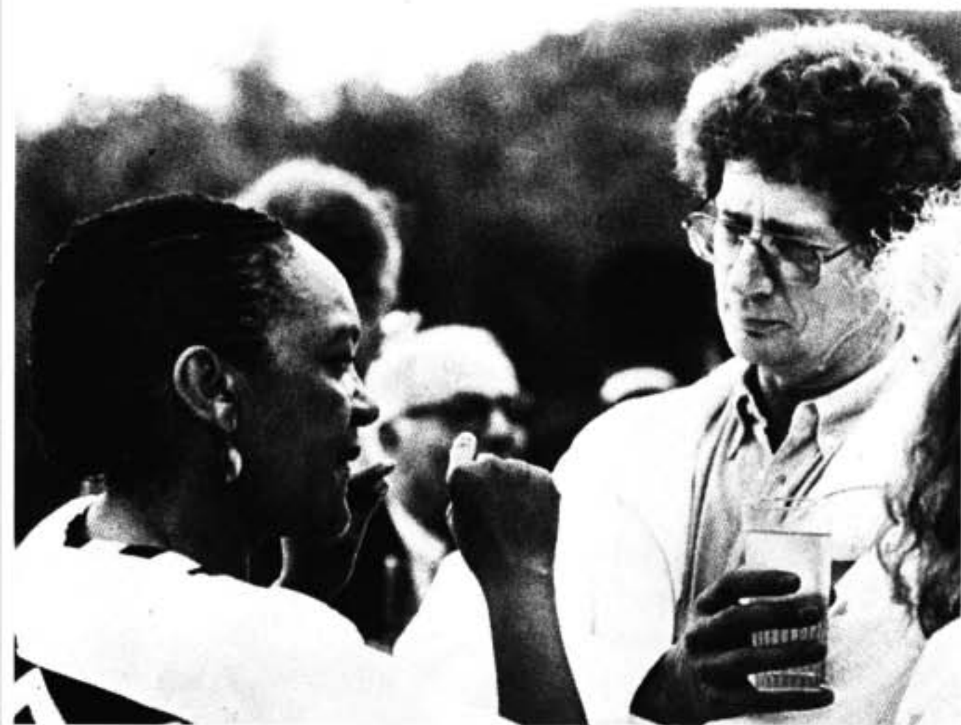
Barbara Masekela, Secretary for Arts and Culture, in conversation with Prof. André Brink whose response to the Dakar conference appears on this page.