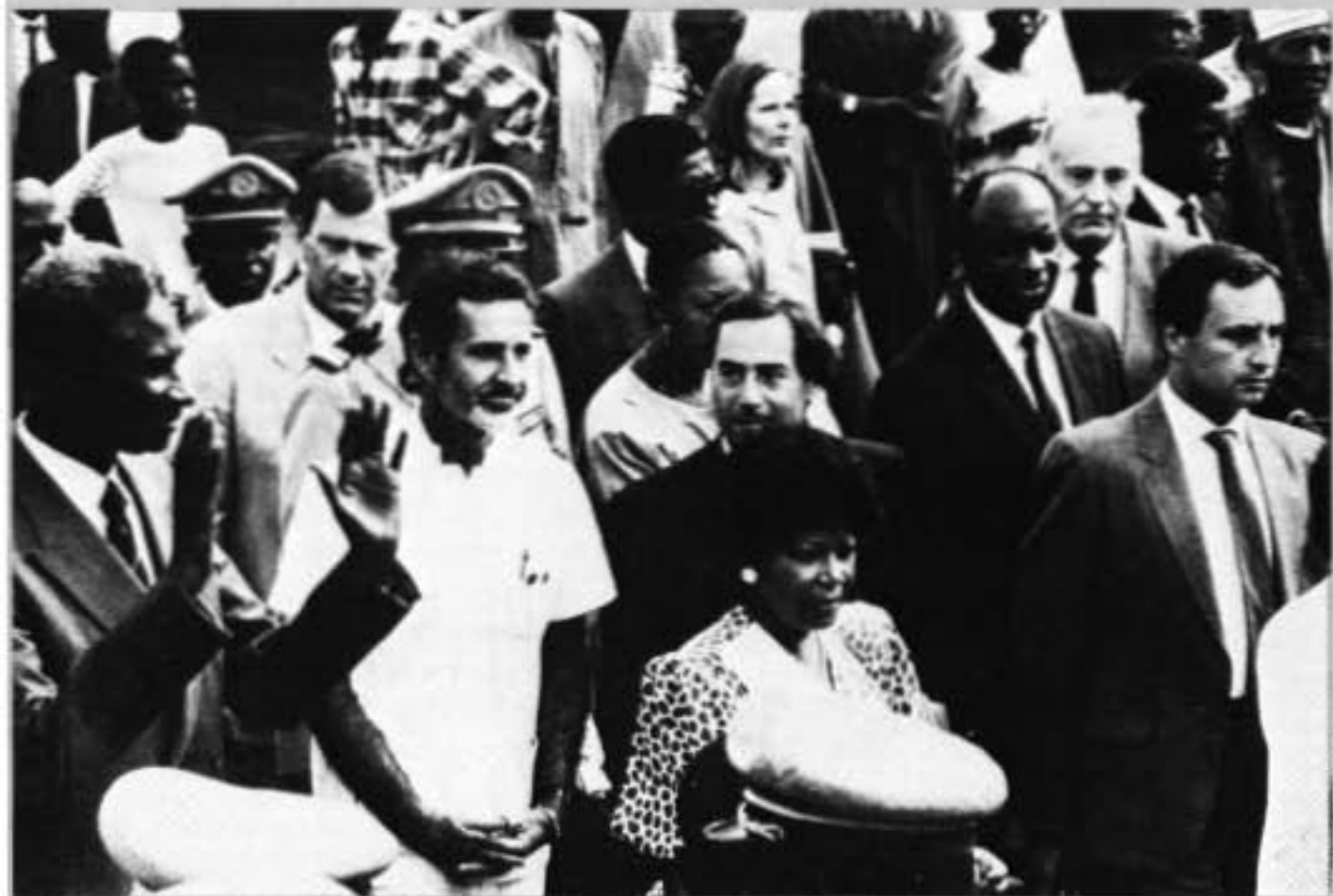
President Abdou Diouf of Senegal (left), Dr. van Zyl Slabbert, Breyten Breytenbach and the President's entourage move towards the official opening ceremony of the conference in Dakar.