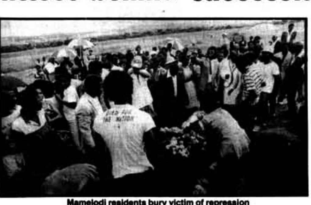
Mamelodi residents bury victim of repression

MAYO has been operating street committees since last year. MACA