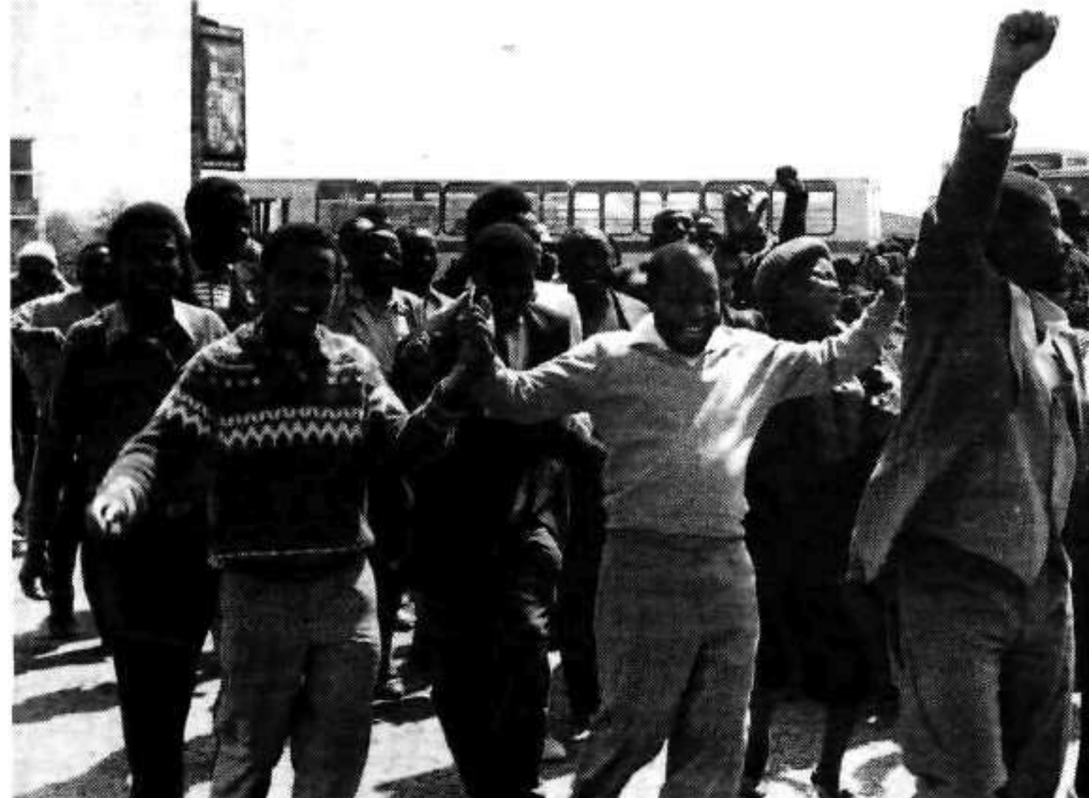
Chemical workers sing their way along to the annual general meeting

In terms of the new agreement Mercedes' workers will also get a service attendance allowance which for those with ten years service works out to be a further 10c per hour.