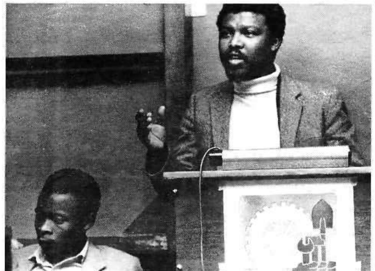
THE Pinetown group give their talk on the role of shop stewards