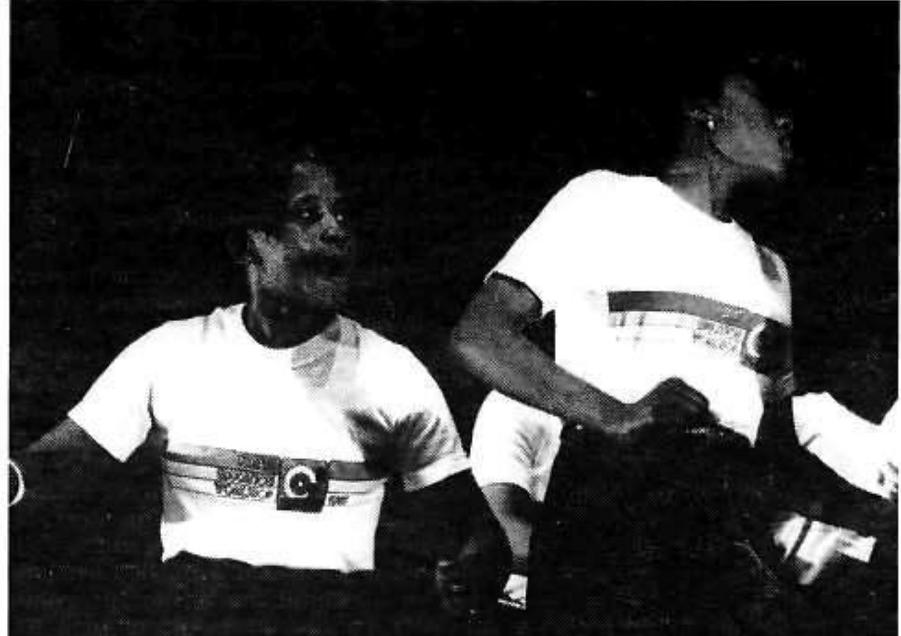
DANCING and singing - two of the members of the Pretoria chair