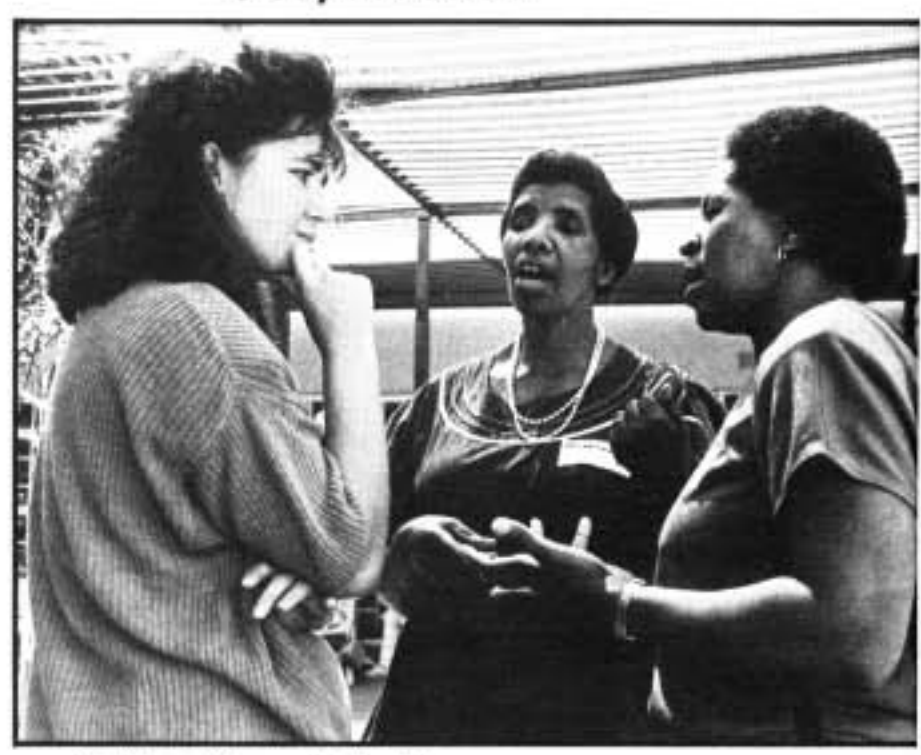
... And she listened intently ....