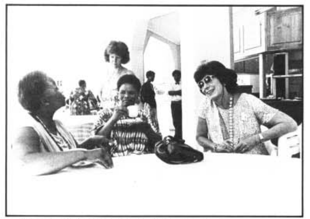
... And she threw from her gladly the mantle of Ancientreceived opinions ...

Months of consultation, planning and intensive training of facilitators culminated in the Transvaal region's WOMEN AND DEMOCRACY conference which took place near Rustenberg on 10-12 March. The conference was attended by some 80 women who were invited on the basis of the influential roles they play in their sphere of work, community or organisation or because of their specific experience of the disruption and sorrow caused by conditions existing in our country today. A detailed report of the conference will appear in the next issue of Democracy In Action.