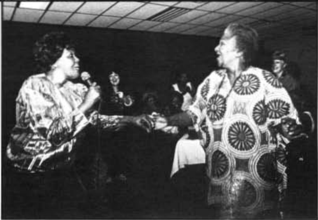
And I dreamed I saw a land. And on the hills walked . . brave women . . . hand in hand . . . And they looked into each other's eyes, and they were not afraid

... They are the feet of those that shall follow you. Lead on!"