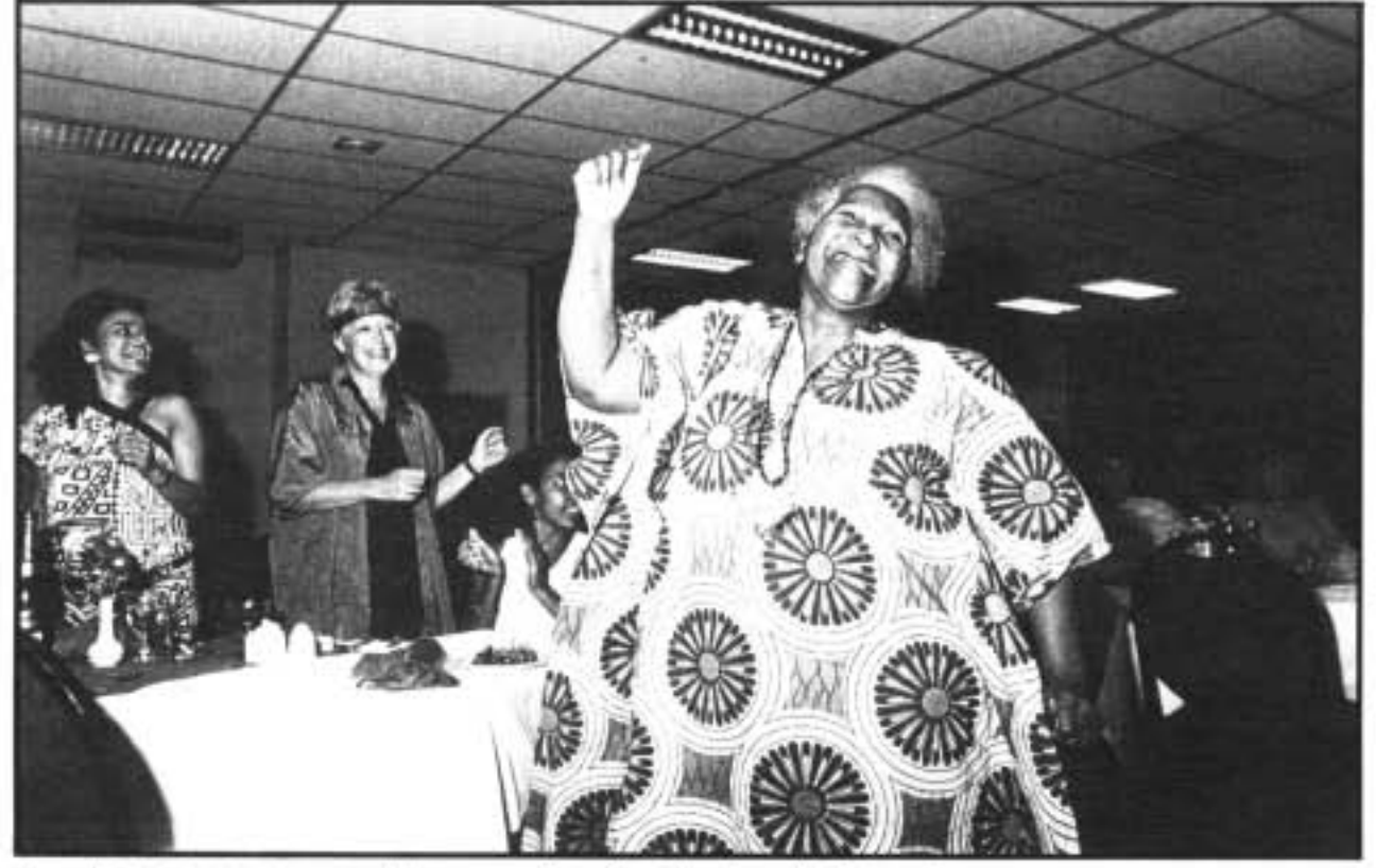
... I am a woman, and I am seeking for the land of Freedom ....