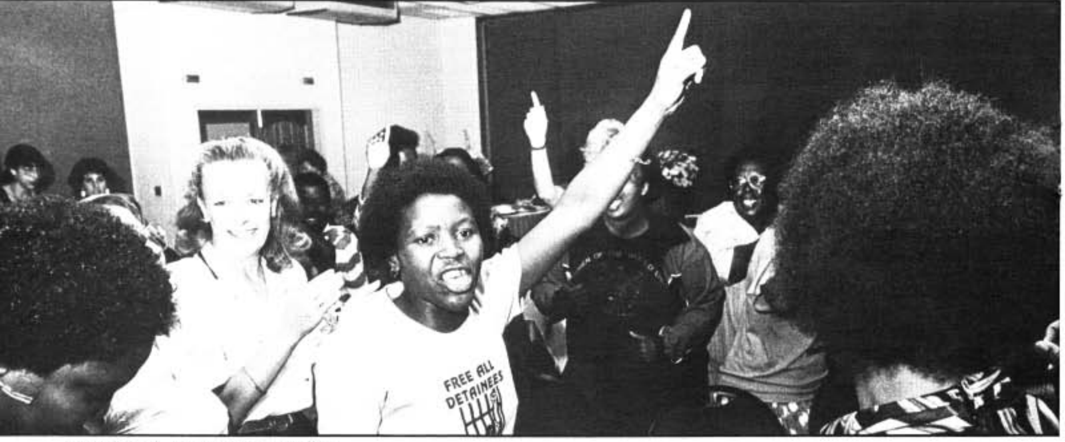
... and she said, "I hear a sound of feet ....