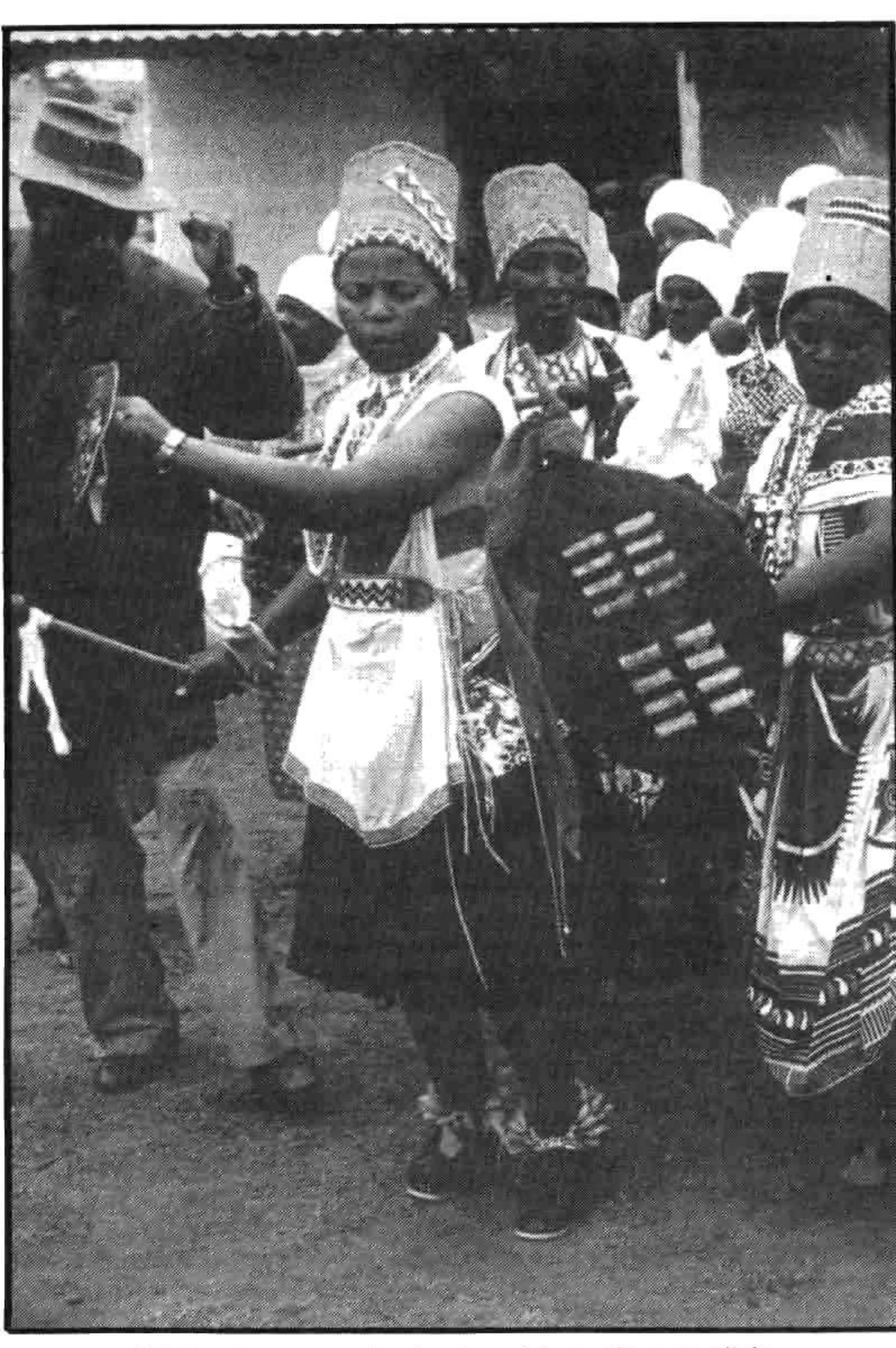
Driefontein women dancing to celebrate the new clinic