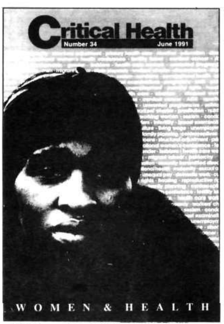
1991: Upsurge in level of debate in the health sector. Editions getting thicker.

We asked readers what they liked about the journal and what they disliked. It was encouraging to see that positive responses overwhelmingly outnumbered those that were unfavourable. The majority of readers answered that