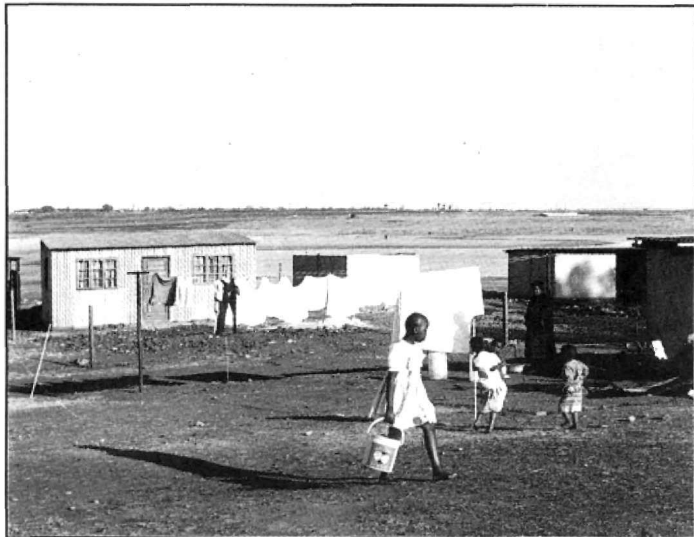
Tamboville. Civics have to demand that local authorities, with their greater resource and skill base, engage in joint ventures with the civic.

smaller proportion from the national department of health. Alexandra Clinic has been successful in developing with little support from its wealthy neighbouring local authority, Sandton. Wattville, on the other hand, is pursuing sustained comprehensive development - which includes the construction and running of a health facility. Not having access to an institution such as Wits University, the civic has to demand responsibility from the local authority. This includes the Benoni Town Council, and the TPA, both of whom have a range of resources. Ultimately, they have a far greater resource and skill base than the civic. While Alexandra Clinic has for so long not depended on the Sandton municipality for resources, there is a responsibility of such a local authority with a rich resource base to engage in a joint venture. This applies to future negotiations between civics and local authorities in general.