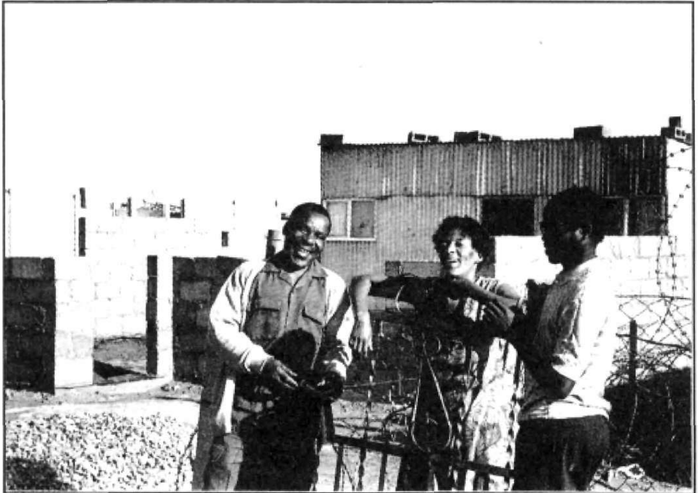
Through negotiations the Benoni Town Council agreed to provide serviced sites for Tamboville.

A working group involving the civic, the Community Health Committee and the other interested parties have been meeting to plan a coordinated approach to the planning, implementation and operationalisation of the project.