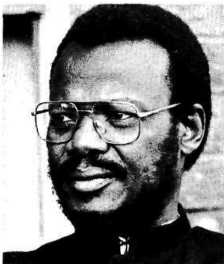
Dr M G Buthelezi

C hief Minister Buthelezi and Minister Heunis met in Durban today, 9 January 1989. After discussions they agreed to issue the following joint statement: