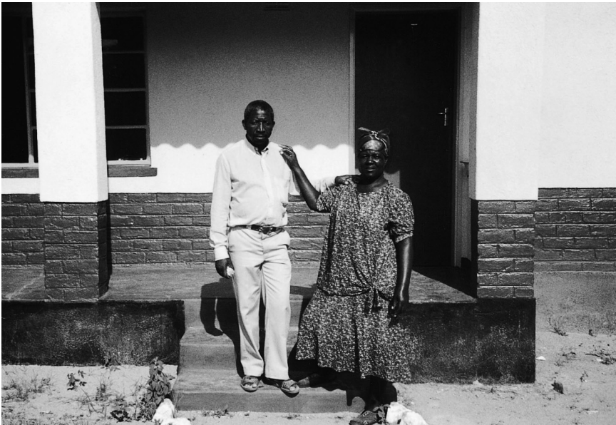
A man and his wife, in Zimbabwean attire, stand outside their home.