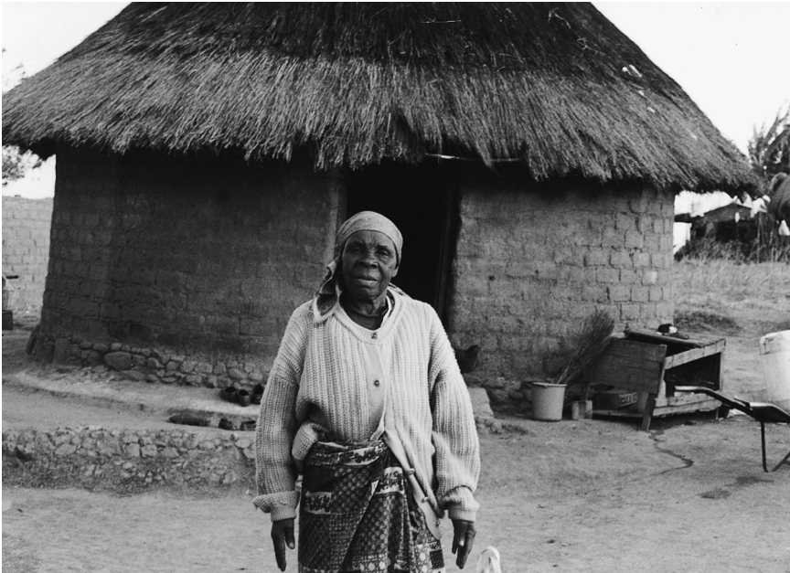
Zimbabwean grandmother in front of kitchen hut.