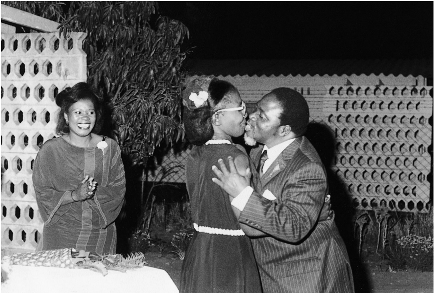
Inspired by the Shona marriage ceremony, a romantic couple indulges at the reception.