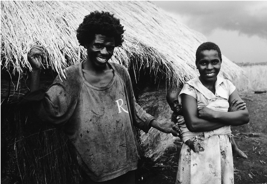
Zimbabwean Family.