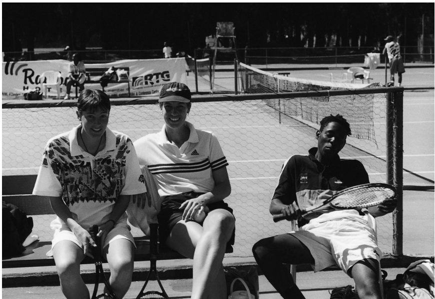
Tennis players.