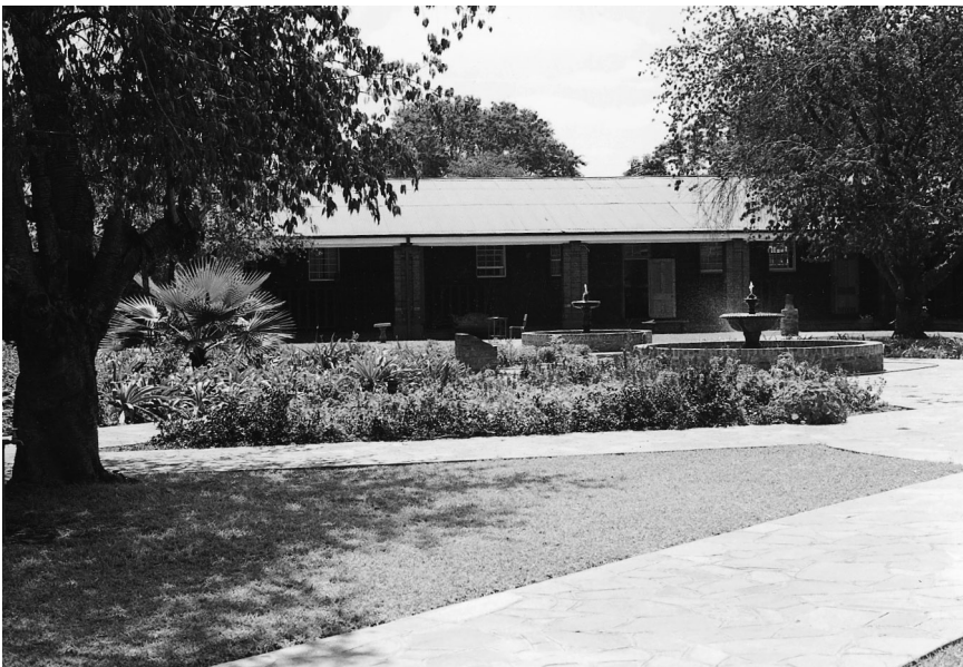
Prince Edward School, Harare.