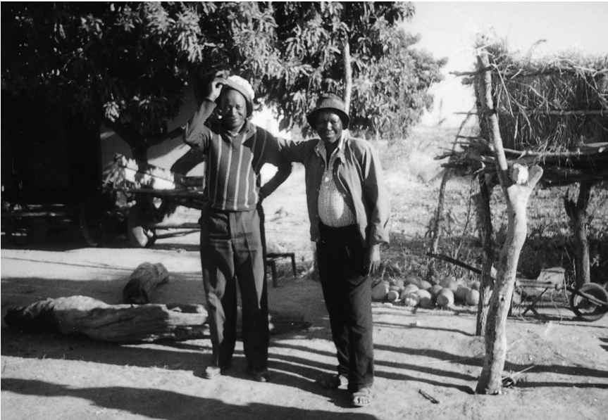
These two sons of a distinguished police officer relax in the Zimbabwe sun of the Kapungu homestead in Jari.