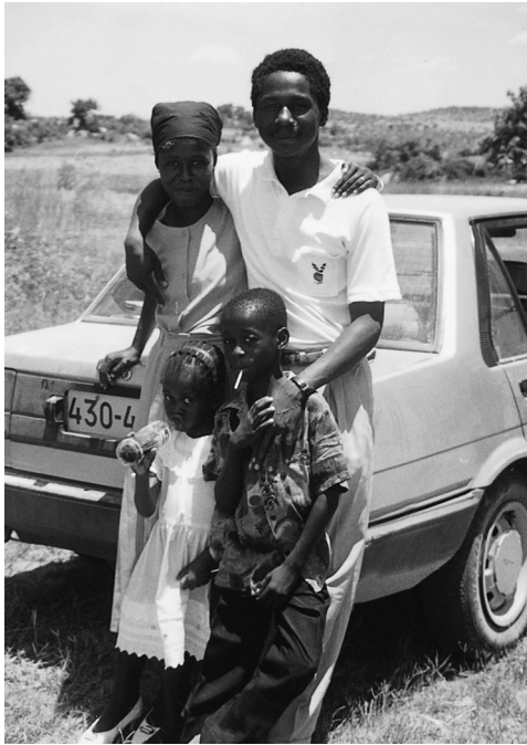
A Zimbabwean couple and their children pose for a family picture.