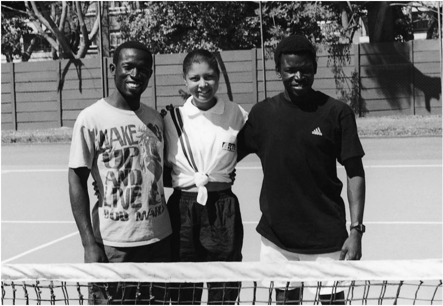
Tennis players.