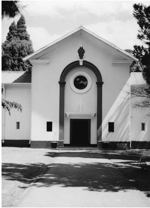
Memorial Chapel at Prince Edward School, Harare.