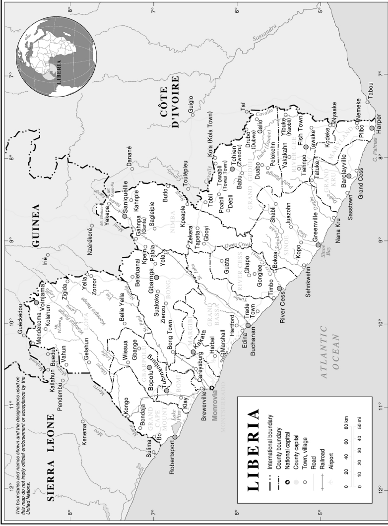
The map of Liberia has been reprinted with kind permission from the Board of the United Nations Cartographic Section. Liberia no. 3775 Rev. 5.