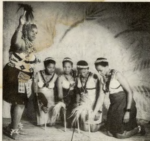
The Smelling-Out Dance