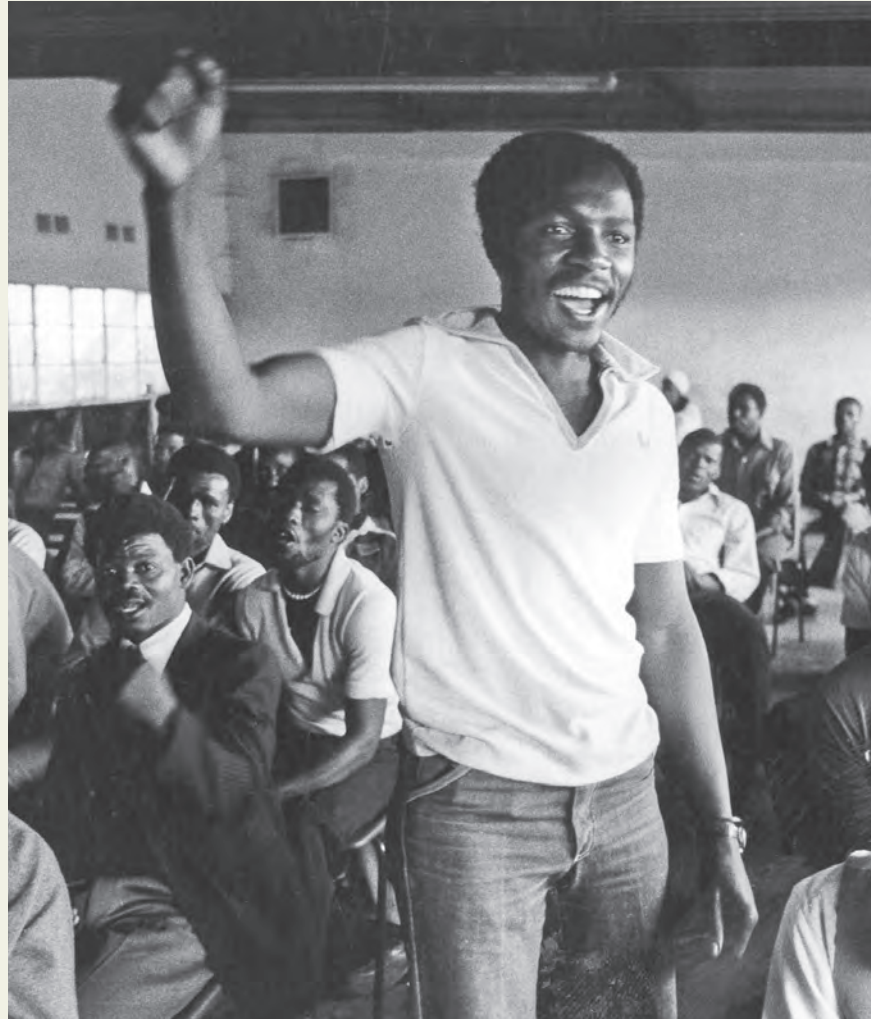
WORKERS MEET DURING THE FIRESTONE STRIKE, AUGUST 1983 Photo by Paul Weinberg, Taffy Adler Papers, AH2065/J128

HOW DO UNIONS TODAY PROTECT THEIR WORKERS FROM SUCH PRACTICES AS THE CASUALISATION AND INFORMALISATION OF LABOUR?