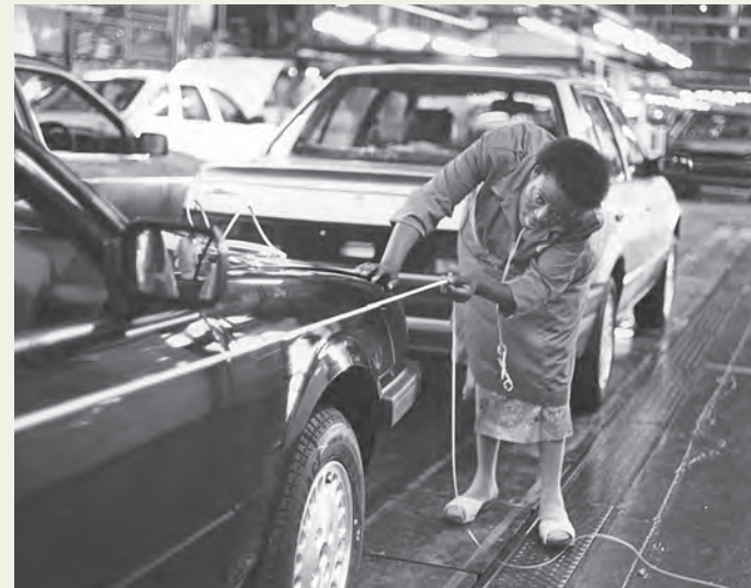
A WOMAN WORKER PUTS FINAL TOUCHES TO CAR PAINT

ARE THERE OTHER FACTORS WHICH REDUCE THE STRENGTH OF INDUSTRIAL BARGAINING NOW, COMPARED WITH THE HEYDAY OF FOSATU?