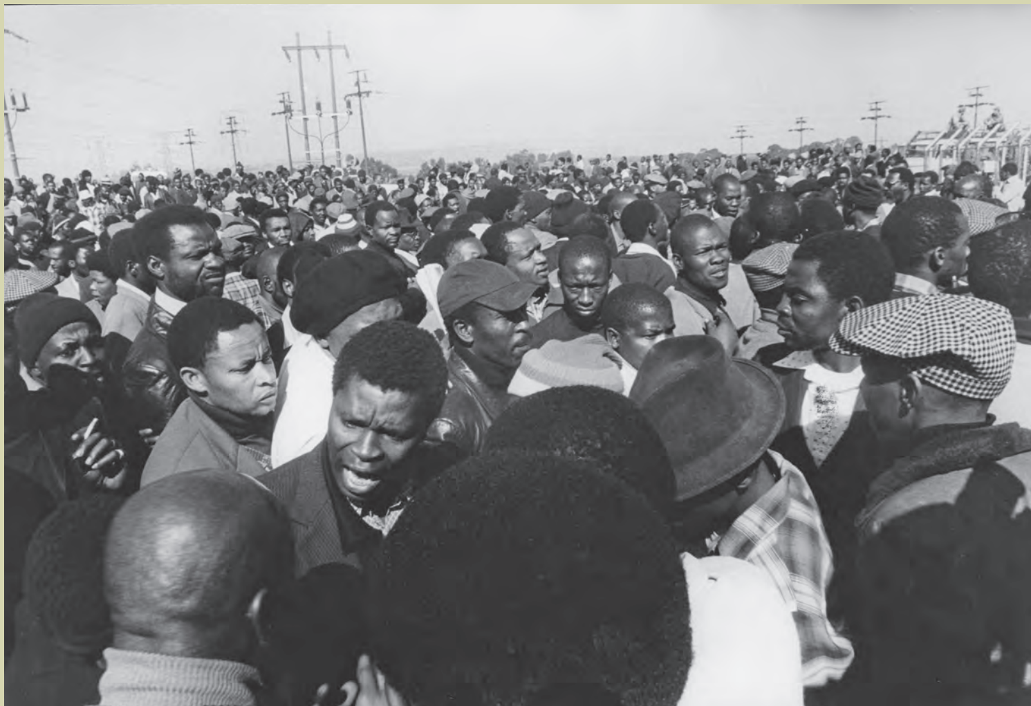
THE PUTCO STRIKE, 1980

Very few of the Cape unions participated in the talks about unity and thus continued to exist as independent trade unions outside of FOSATU.