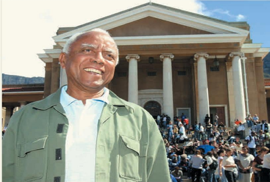
Dr. Neville Alexander (75) is gisteroggend aan kanker oorlede.