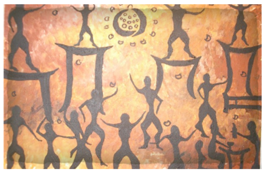
Modern artwork from a club.

In Medical terms it comes from the Latin masturbari : "to pollute oneself from L.manus [hand]" and stuprare/turbare: "to defile with the hand, to disturb, agitate or rub". The Greek word is mezea – the stimulation of organs that usually leads to orgasm. This is the whole Kundalini awakening without a partner, but can be activated in a group setting through ecstatic rituals. Witches call it the ultimate blasphemy against God.