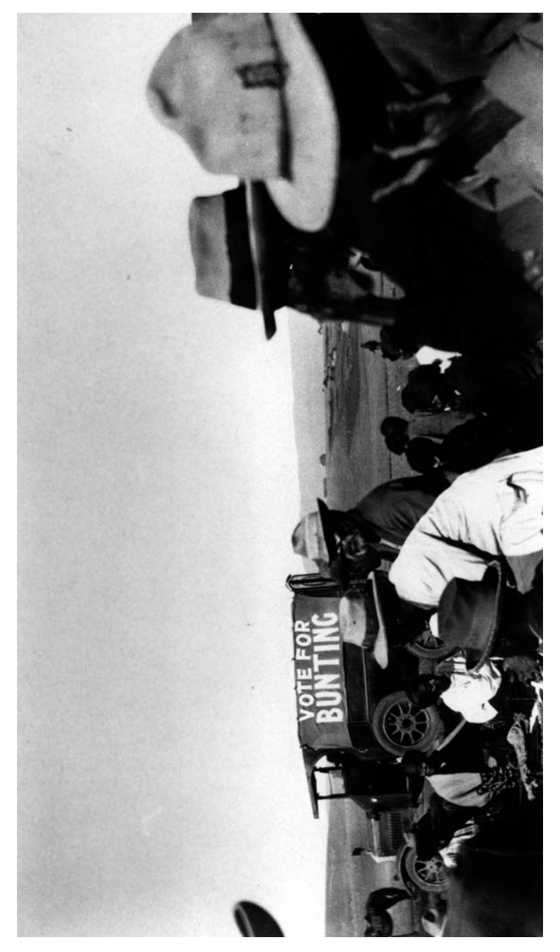
Figure 7: A crowd waiting to hear Sidney Bunting speak during his 1929 electoral campaign in Thembuland.