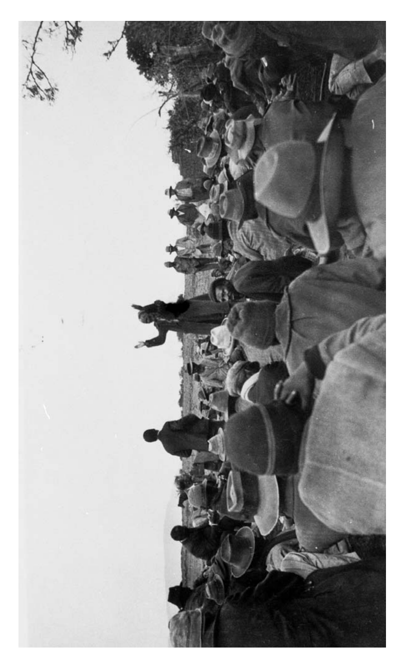
Figure 8: A crowd at one of Sidney Bunting's meetings during his 1929 electoral campaign in Thembuland. Sidney is seated to the left of the two main standing figures.